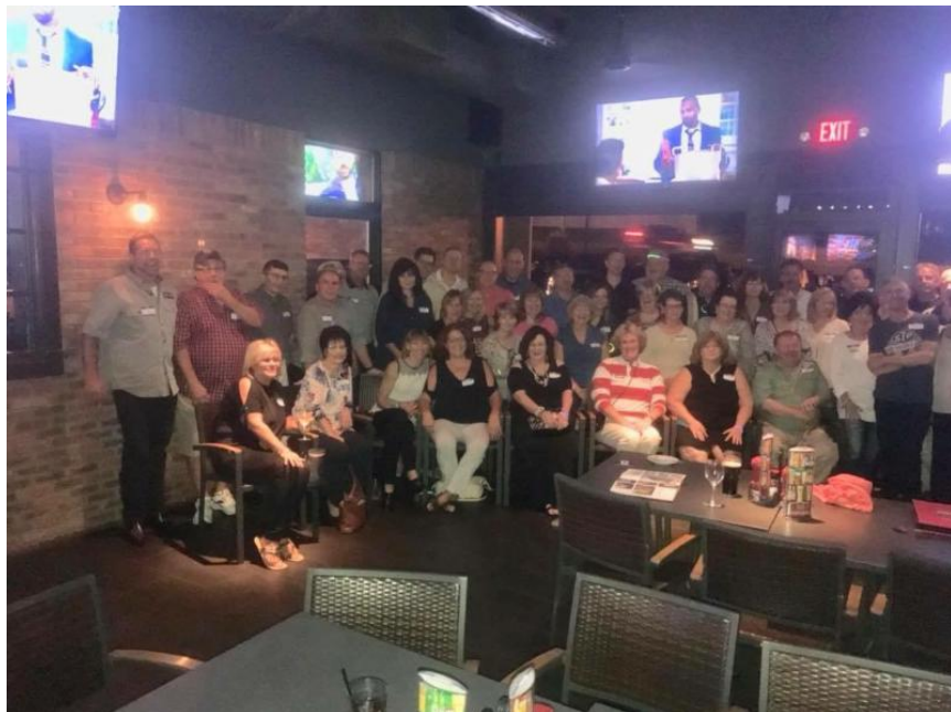
Central Catholic Class of 1970 - SemiAnnual Breakfast