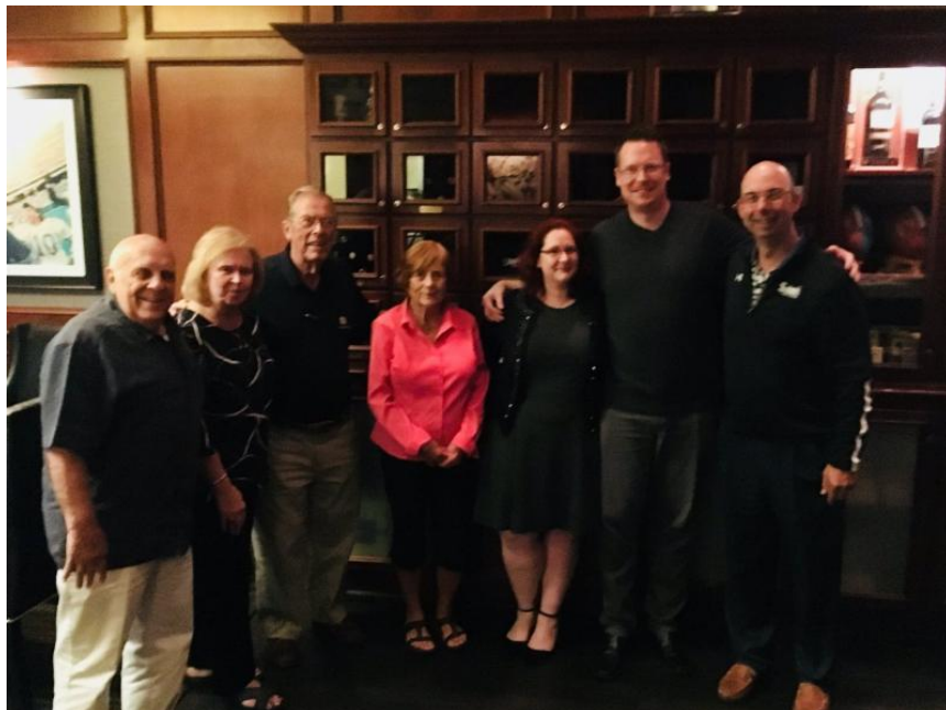
Alumni Gathering at Third & Spruce in West Reading