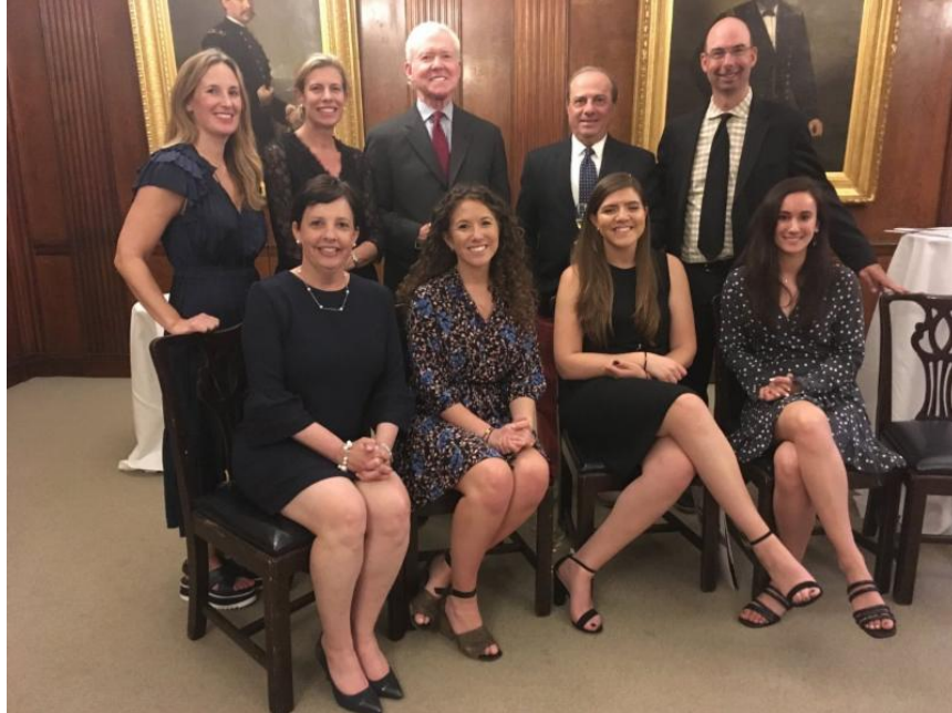
Alumni Gathering in Naples, FL