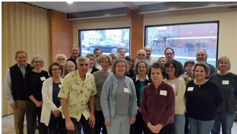
Alumni Gathering at the Union League Club in New York City