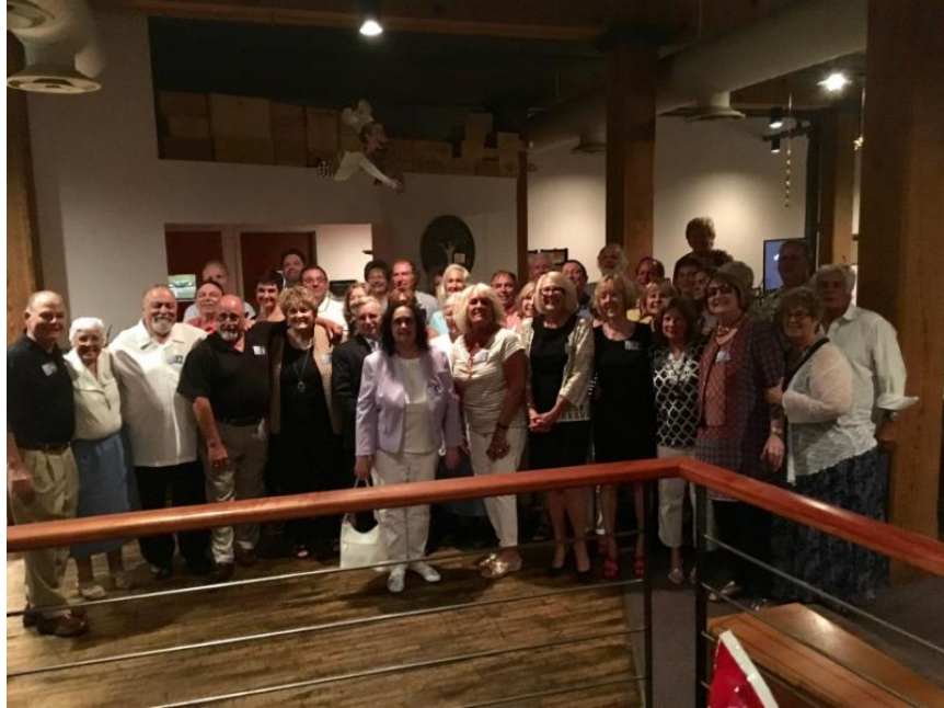
Holy Name Class of 1979 - 40th Class Reunion