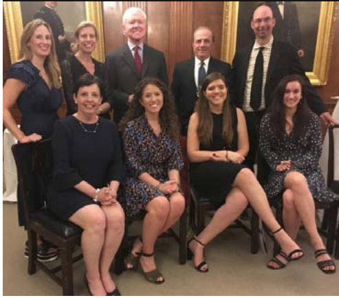
Thanks to all who came out for the Fifth Annual Alumni Get-Together at the Third & Spruce Café.