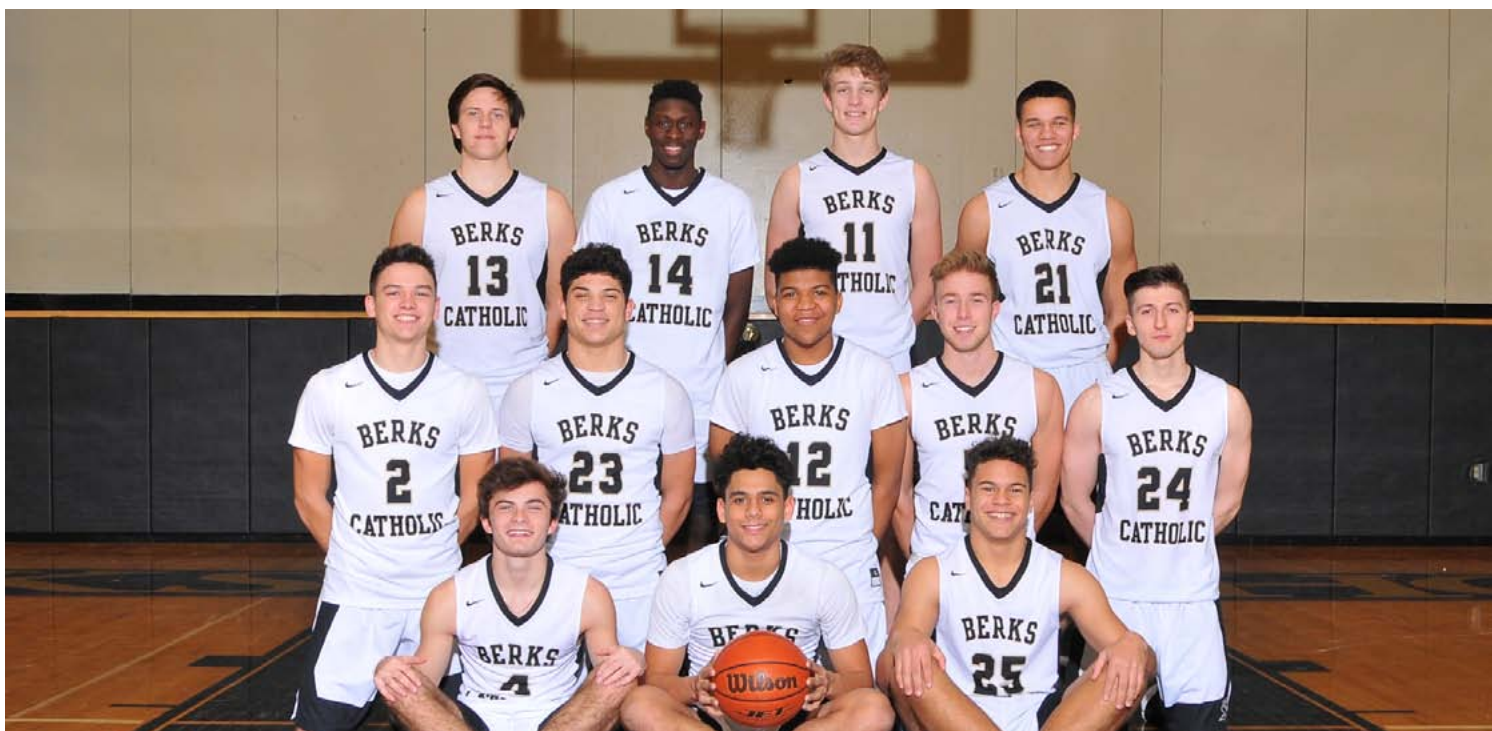
▲ Boys Basketball Team won Division, League, and District Championships