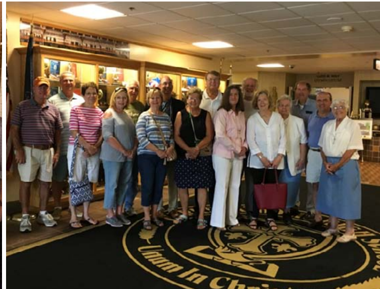
Holy Name Class of 1967 Reunion Tour