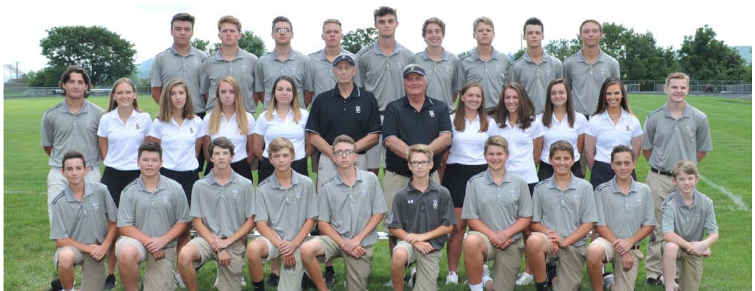
▲ Golf Team won Division Championship