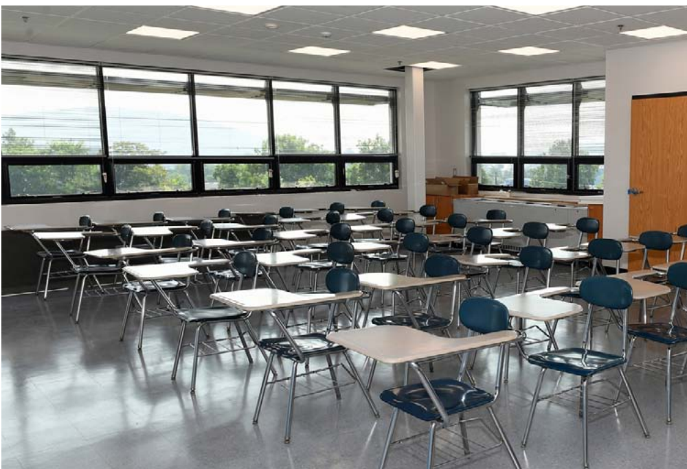
▲ One of six new classrooms