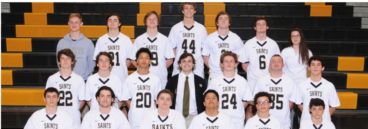
▲ Boys Lacrosse Team won Division Championship