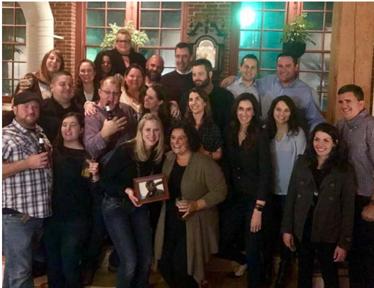
Holy Name Class of 1997 – 20th Reunion