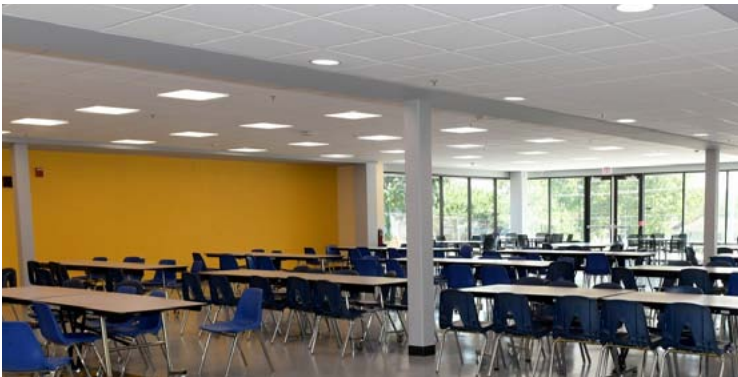
▲ Cafeteria Expansion