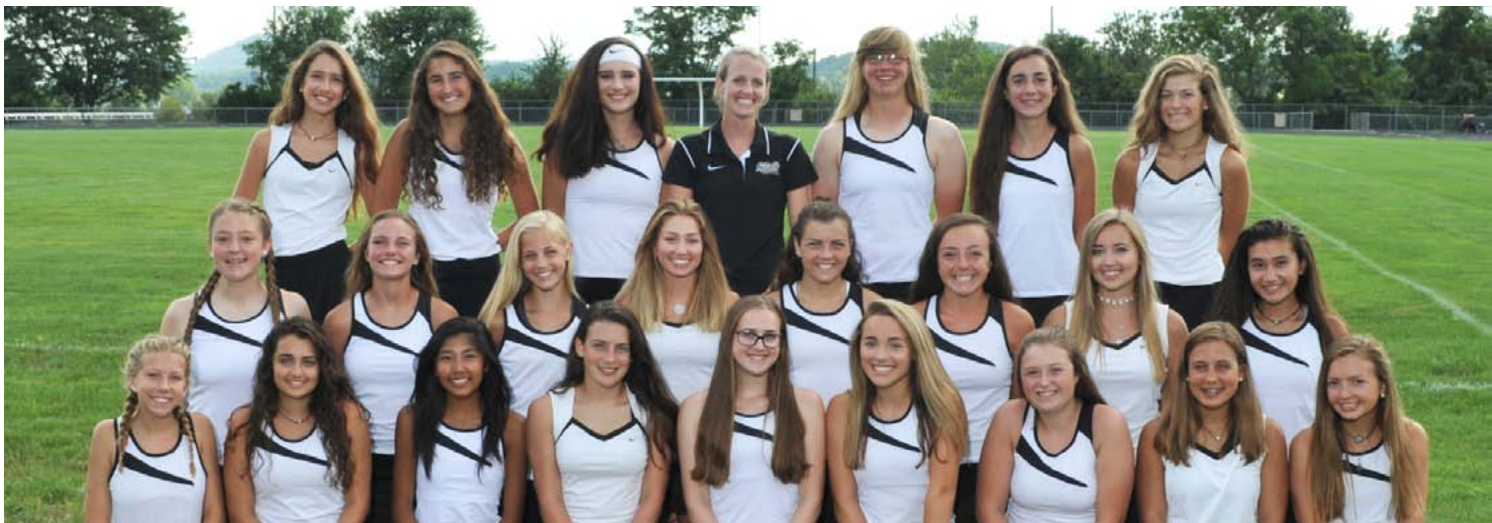
▲ Girls Tennis Team won Division Championship