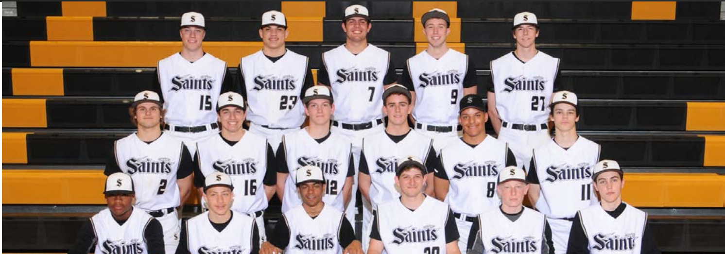
▲ Baseball Team won Division Championship

All photos are of CHAMPIONSHIP winning teams. Go Saints!