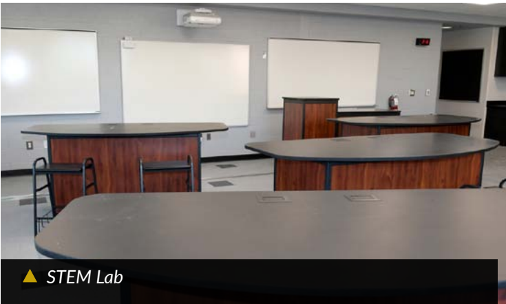
▲ STEM Lab