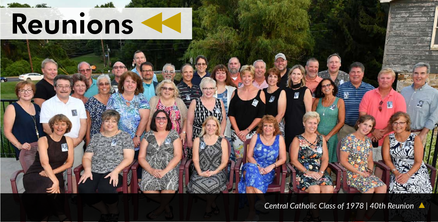
Central Catholic Class of 1978 | 40th Reunion