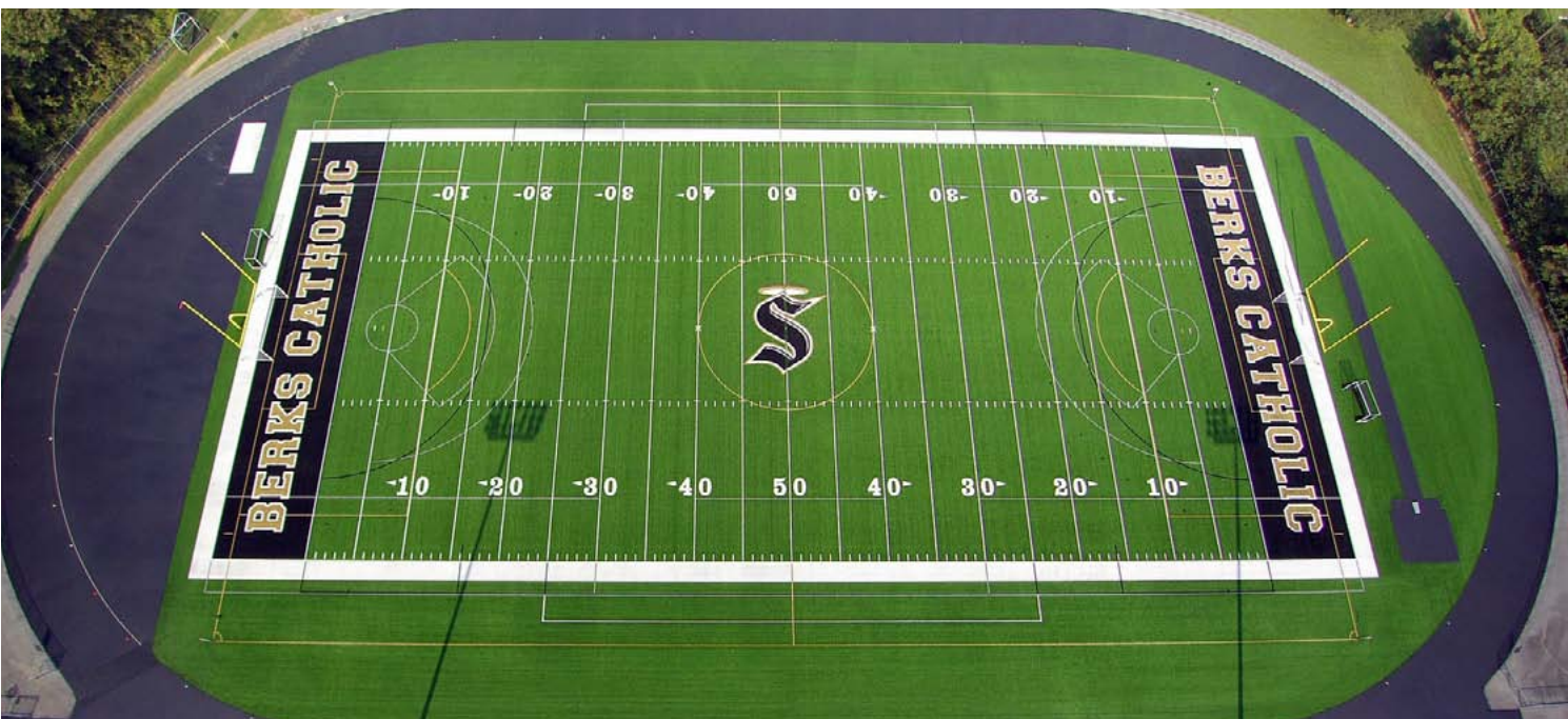
▲ New turf field