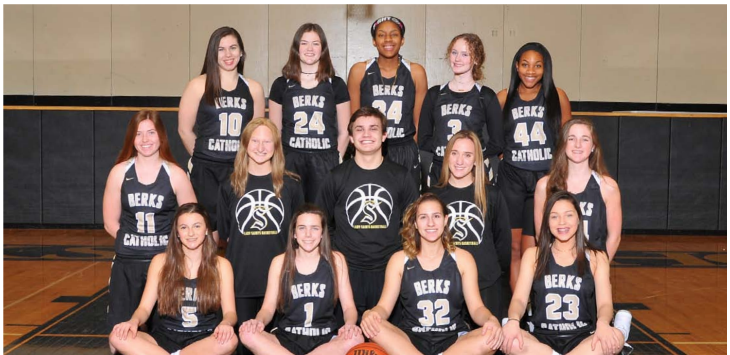
▲ Girls Basketball Team won Division and League Championships and were first runner up in District and State