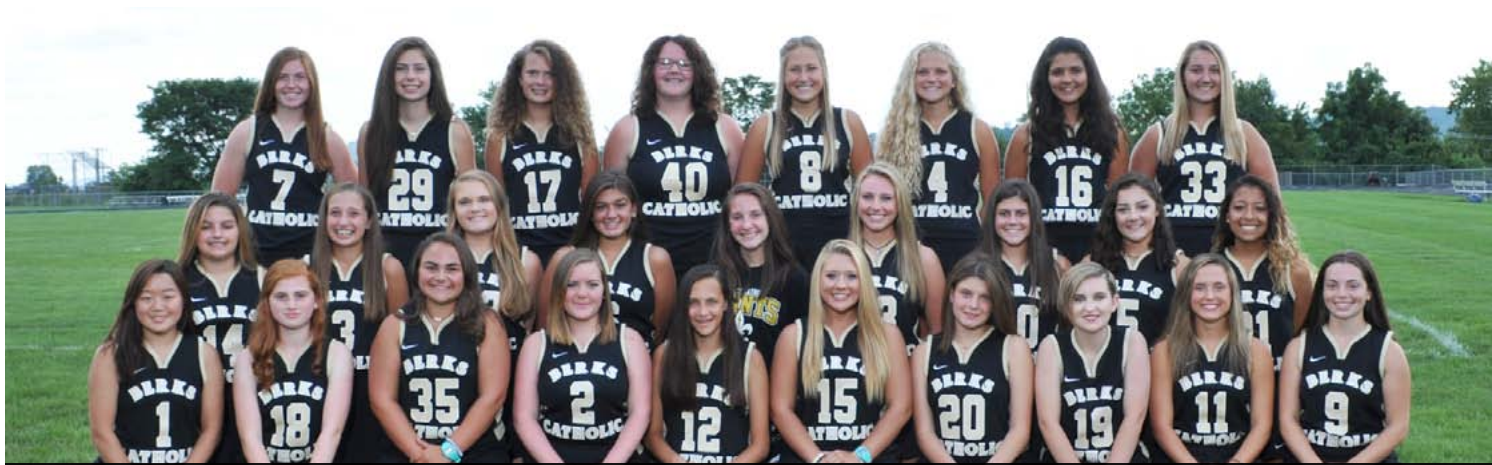
▲ Field Hockey Team won Division Championship