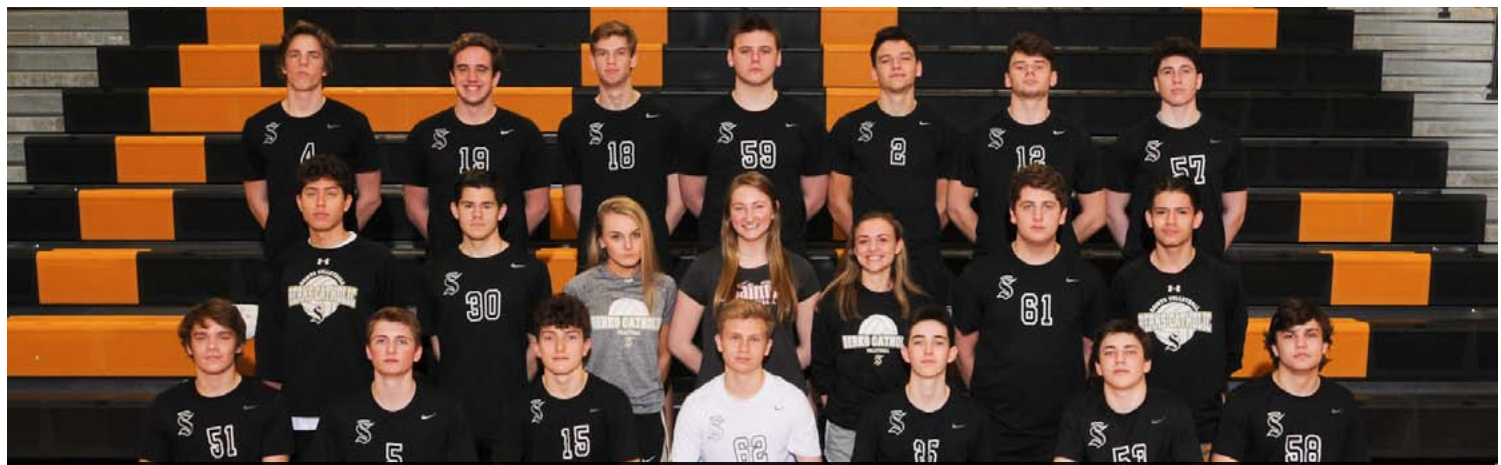
▲ Boys Volleyball Team won Division Championship