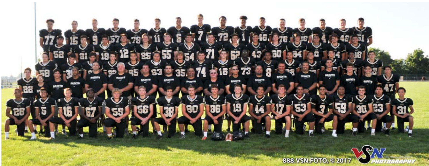
▲ Football Team won Division, League and District Championships