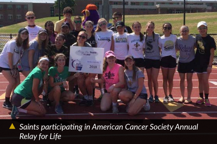
▲ Saints participating in American Cancer Society Annual Relay for Life