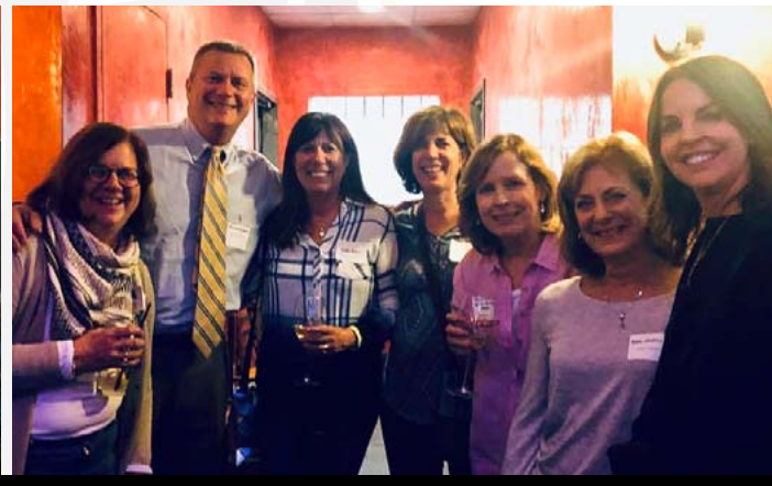
Third & Spruce Café Get-Together