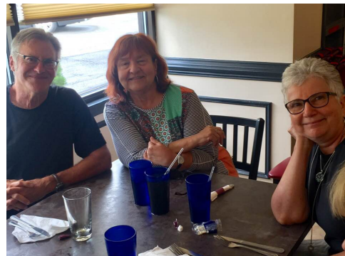
Members of the Holy Name Class of 1969 met for breakfast at the Berkshire Family Restaurant.