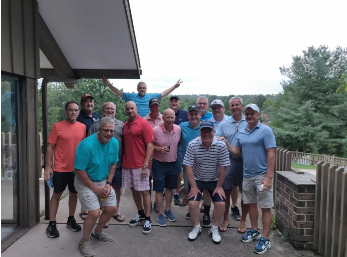
Members of the Holy Name Classes of 1982 and 1983 golfed together at Flying Hills.