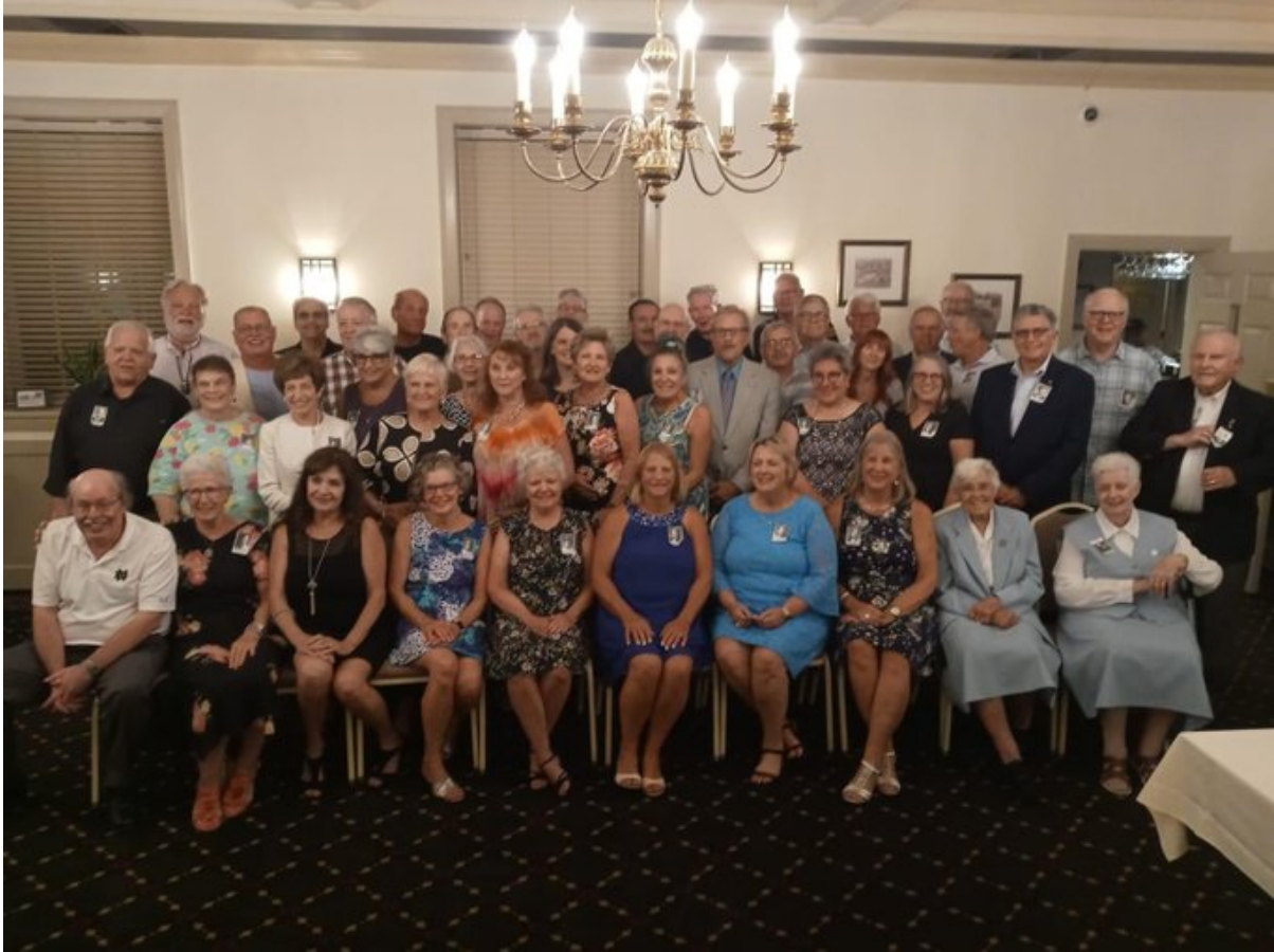
Holy Name Class of 1970 held their 50 +1 year reunion at Moselem Springs.