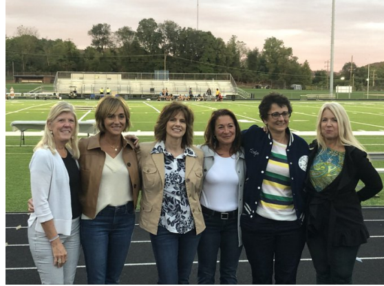
2021 Celebration of State Championship