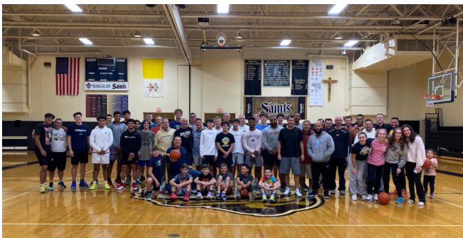
2021 Annual BC Turkey Shoot with current BC players and Alumni from BC, CC, and HN