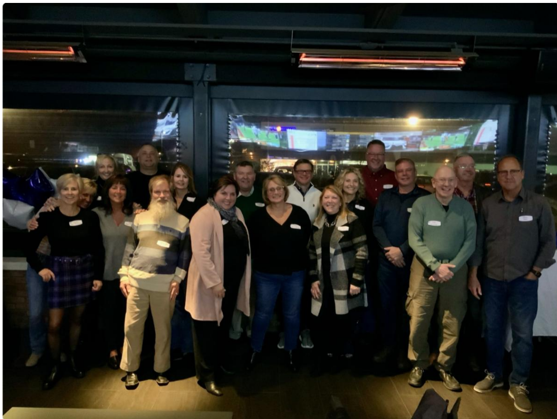
Holy Name Class of 1981 - 40th Class Reunion at PJ Whelihan's