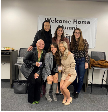
5 Year Reunion in the McGlinn Commons at Berks Catholic