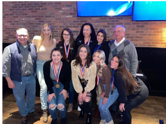
2021 Celebration of State Championship