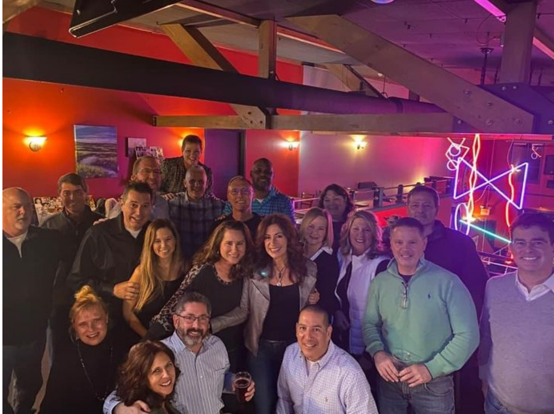
Holy Name Class of 1986 - 35th Class Reunion at the Third & Spruce Drafthaus