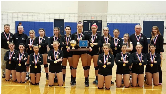
2016 State Champion Girls Volleyball Team