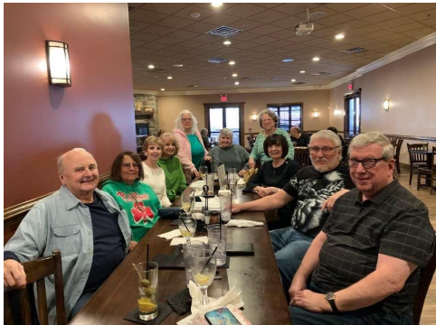
HN Class of 1968 Luncheon