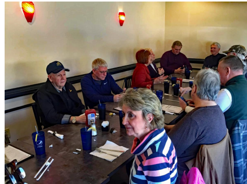
HN 1969 Luncheon