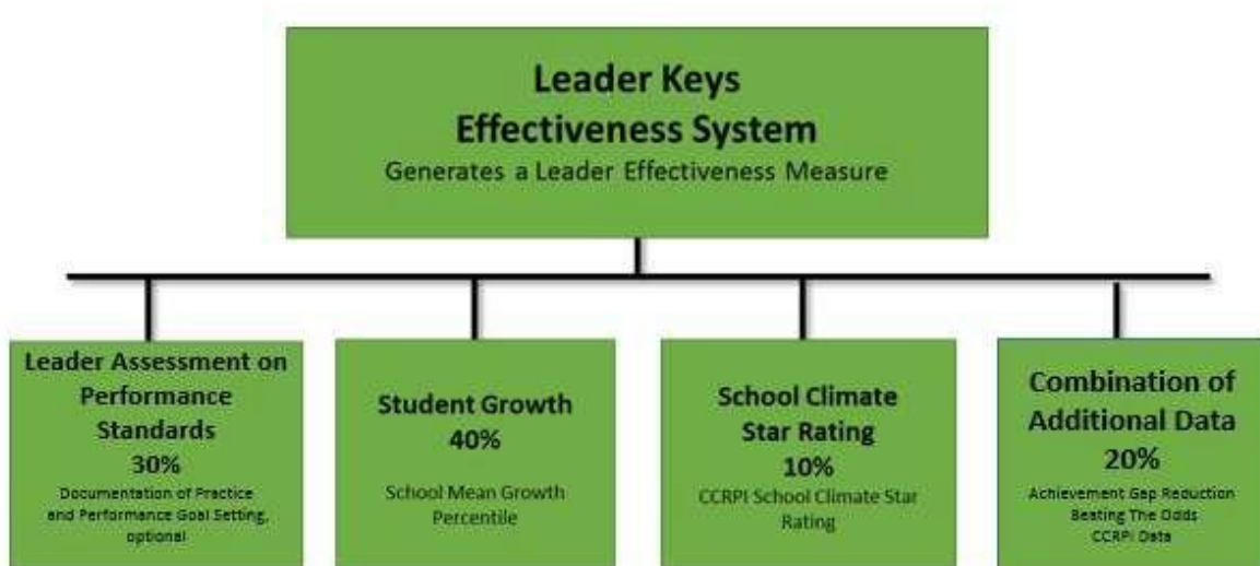
Figure 1: Leader Keys Effectiveness System

The Leader Keys Effectiveness System is depicted in Figure 1.