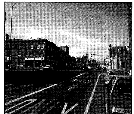
Butte's Historic District

Track (5) East Middle School - Bulldog Memorial Stadium