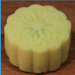
GREEN MUNG BEAN CAKE OR GREEN MUNG BEAN CAKE