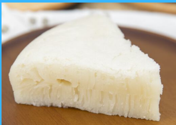
WHITE SUGAR/ HONEYCOMB CAKE