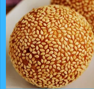
BAHN CAM/ BAHN RAN