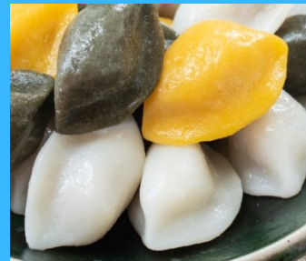
SONGPYEON OR SONGPYEON