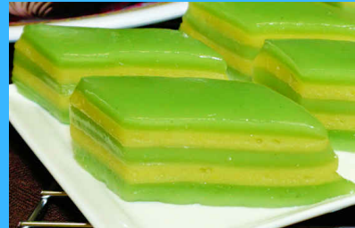
STEAMED PANDAN CAKE