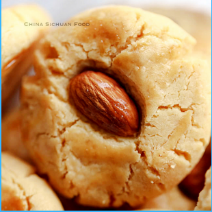
MACAU ALMOND COOKIE