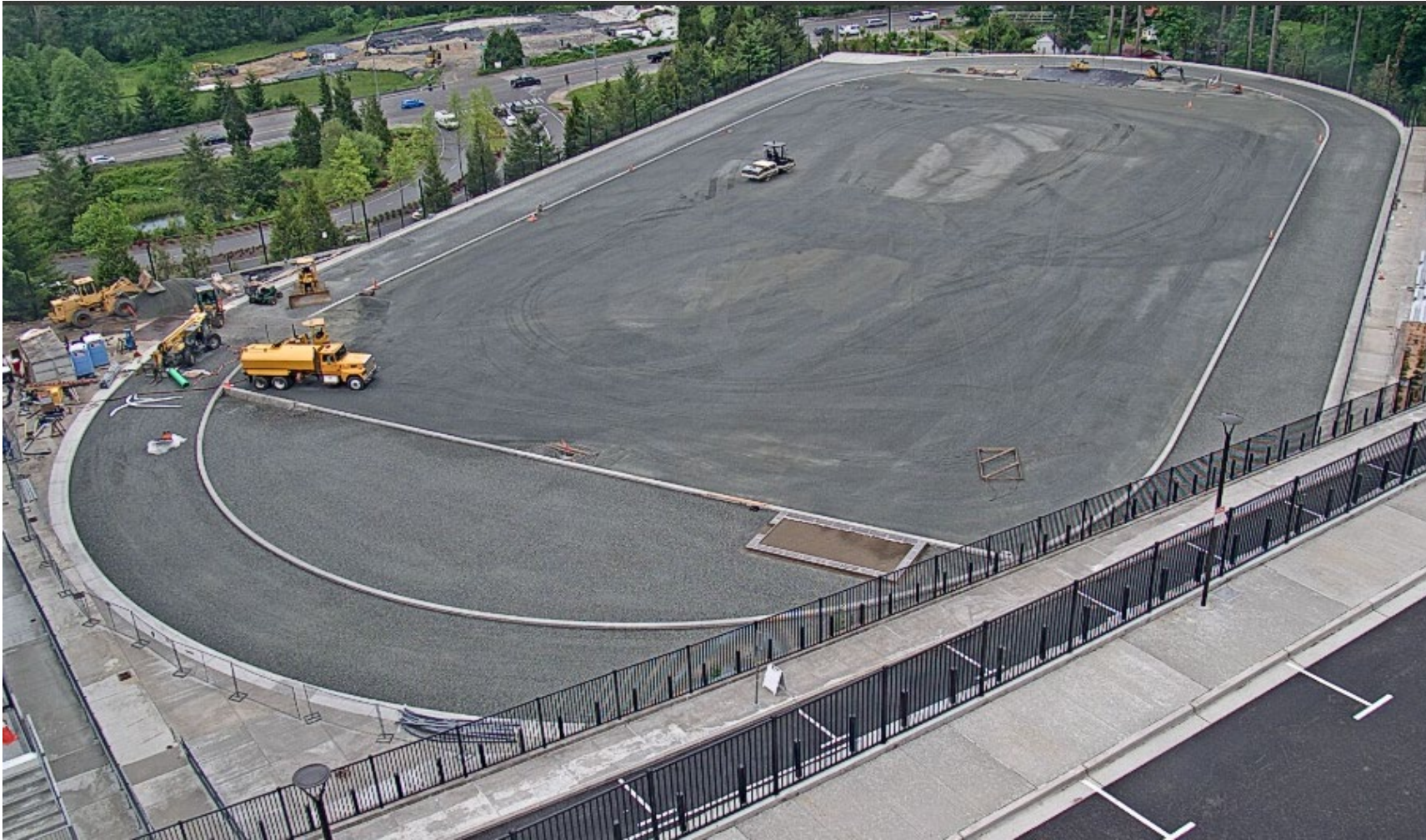
Sports Field work progressing.