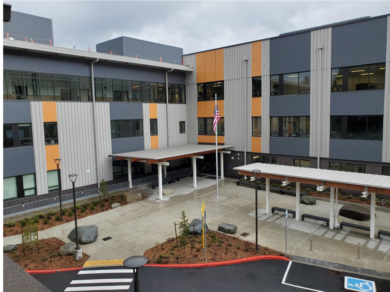
View of the Main Entry from the top floor of the Parking Garage