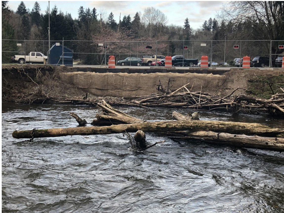
Temporary stream bank protection work completed