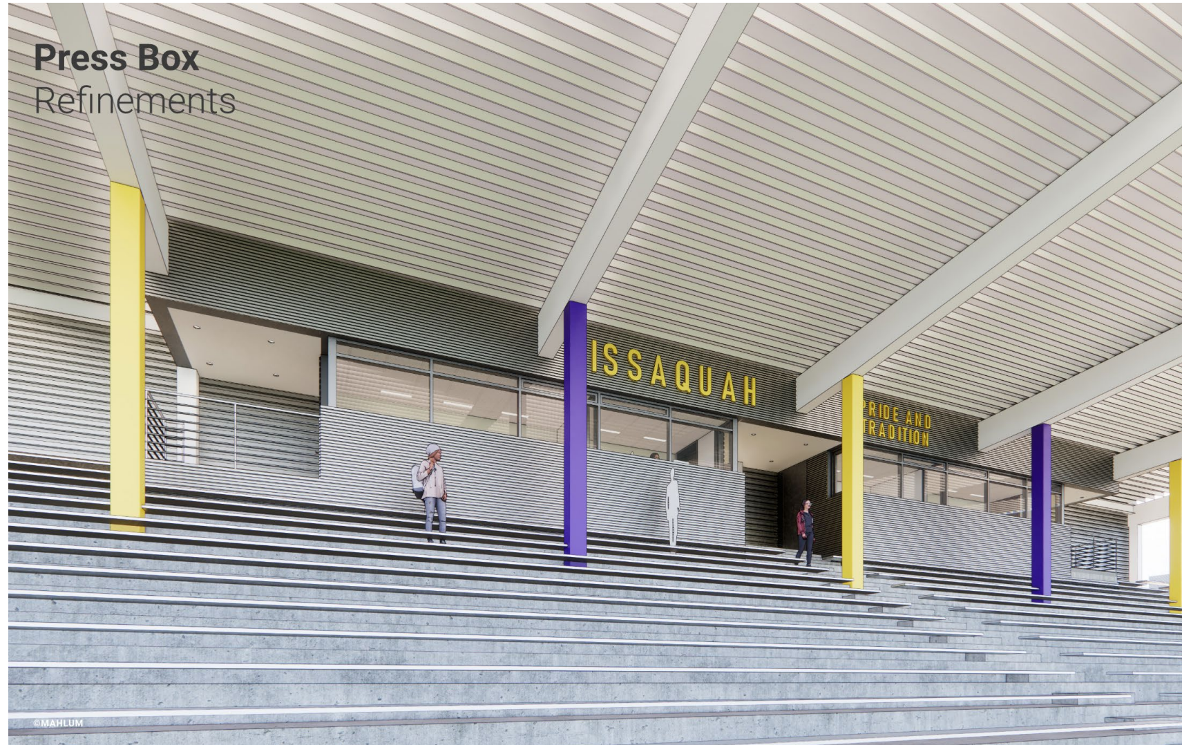
Rendering of potential view of new Press Box.