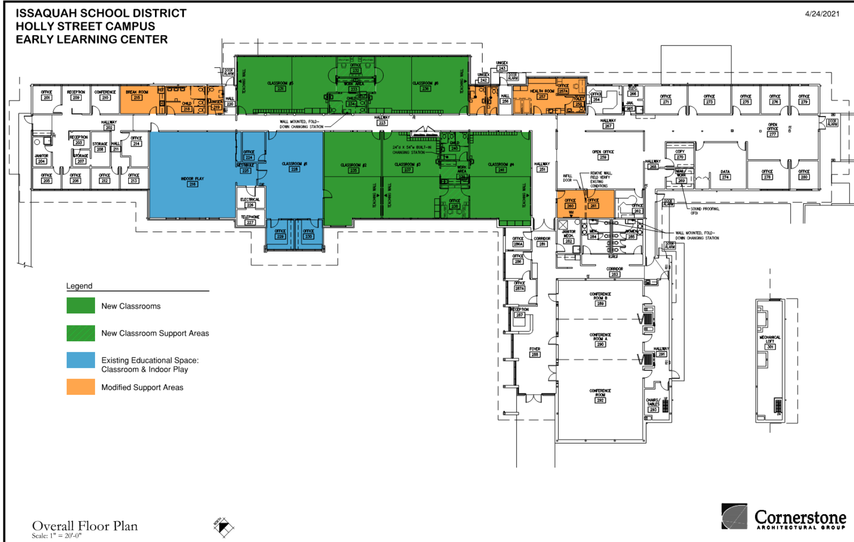
Floor plan for proposed improvements