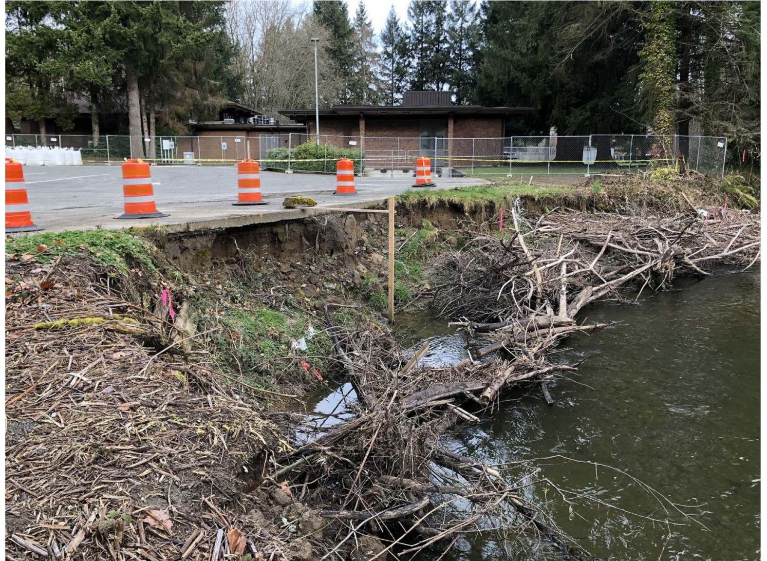
Damage done to the creek bank and parking lot