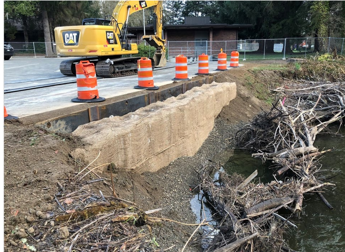
Temporary stream bank protection work completed