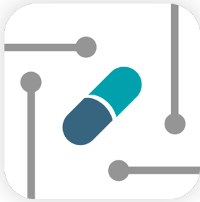
OTC-Anywhere Mobile App