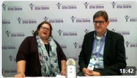
NAGC CornerChat: Anxiety in Gifted Children

Anxiety in Gifted Children (Control, Enter to Watch)