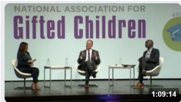
NAGC19: Giftedness Knows No Boundaries Panel Discussion

Giftedness & High Performance (Control, Enter to Watch)