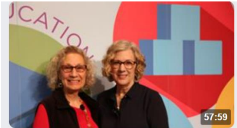
Giftedness and High Performance National Association for Gifted Children 355 views · November 21, 2019

Giftedness & High Performance (Control, Enter to Watch)