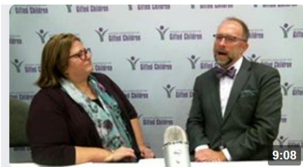
NAGC CornerChat: Questioning Assumptions About Gifted Children &... National Association for Gifted Children 239 views · November 15, 2019

Giftedness Knows No Boundaries Panel Discussion (Control, Enter to Watch)