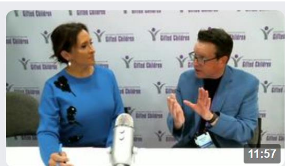
NAGC CornerChat: Encouraging Creativity National Association for Gifted Children 290 views · November 15, 2019

Anxiety in Gifted Children (Control, Enter to Watch)