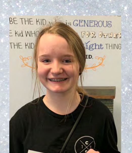
Elliott Salvatori High School