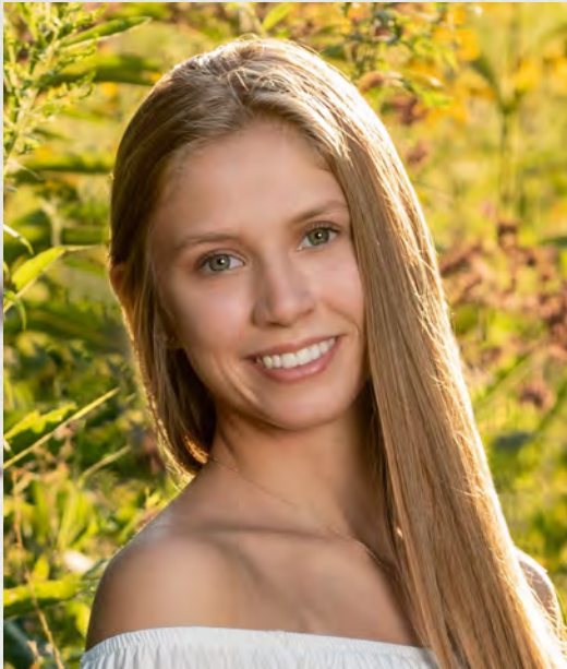
Kristin Leep High School