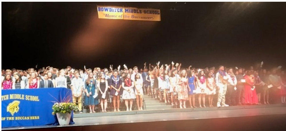
Bowditch Middle School Graduation