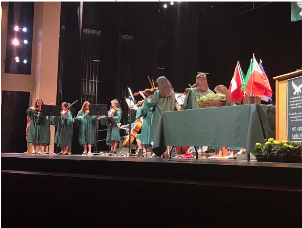
Abbott Middle School Graduation - Orchestra Performance