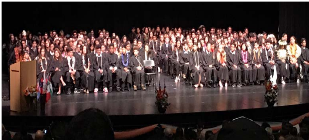
Bayside Academy Graduation