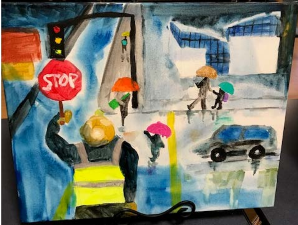
Heroes Around Us