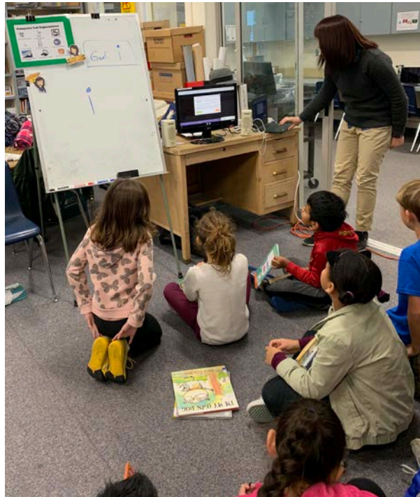
Meadow Heights Elementary

Over 200,000 #HourOfCode events happened around the world during the week of Dec 10-14. Our Bayside STEM, Fiesta Gardens, LEAD & Meadow Heights students used Computer Science in fun, interactive ways like building galaxies with code & color-coding different types of software! #WeAreSMFCSD #STEM