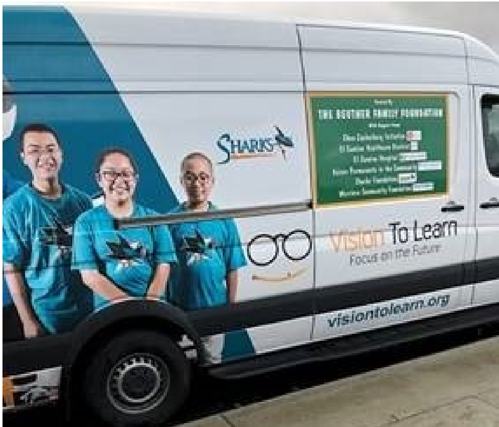
Vision to Learn Van a Success!

Did you know that more than 2 million children in the U.S. do not have the glasses they need to see the board, read a book, or participate in class? To help combat this problem, the Vision to Learn mobile van visited LEAD Elementary last month and served more than 65 students; each receiving a free eye exam and glasses from the program.