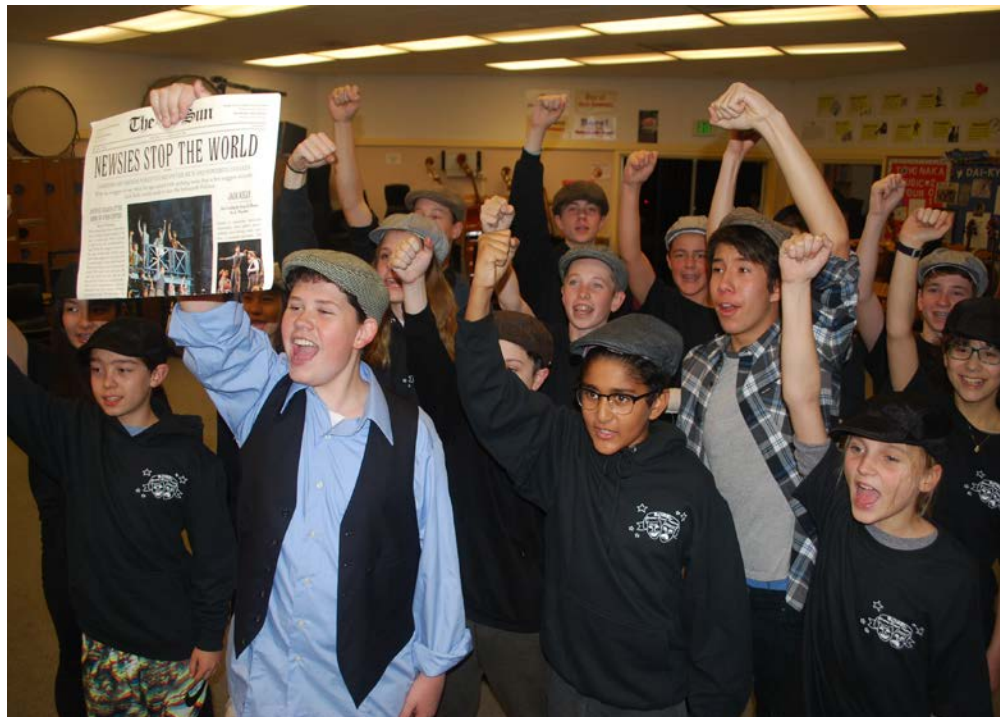
Extra! Extra! Read All About it! Borel Middle School presents Newsies!

Now is the time to seize the day with Borel Drama's production of Disney's Newsies! A two-time Tony Award-winning show, Newsies has audiences calling it "a musical worth singing about!" ( The