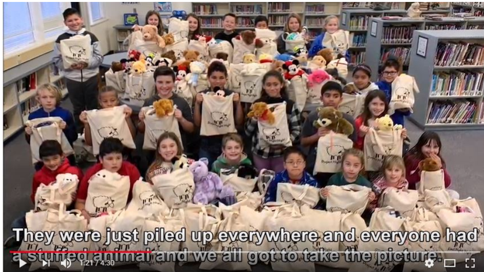
Meadow Heights Project Night Night