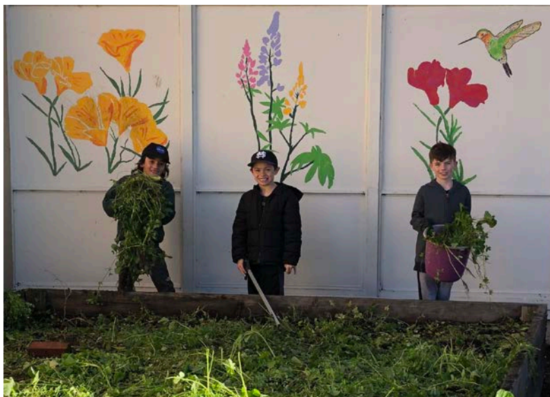
Peninsula Multifaith Coalition at Parkside Montessori