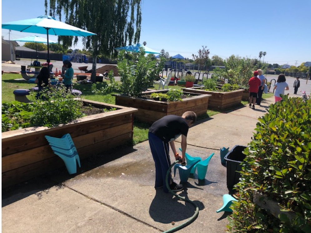
George Hall Beautification

Hundreds of volunteers participated in George Hall Elementary's Spring Beautification Day! Overall, 16 projects/sub-projects were completed (or had significant work done on them) including: