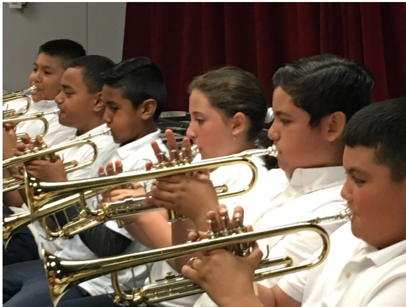
LEAD Elementary 5th Grade Music Concert