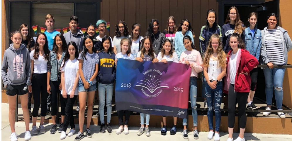
Bowditch Yearbook Staff

Congratulations to the Bowditch Middle School Yearbook class on being awarded, for the second year in a row, the Jostens' National Yearbook Program of Excellence Award! This award is given to less than 10% of all of Jostens' schools throughout the United States. We are very proud of this hard-working class who has created a one of a kind Bowditch 50th Anniversary Yearbook.