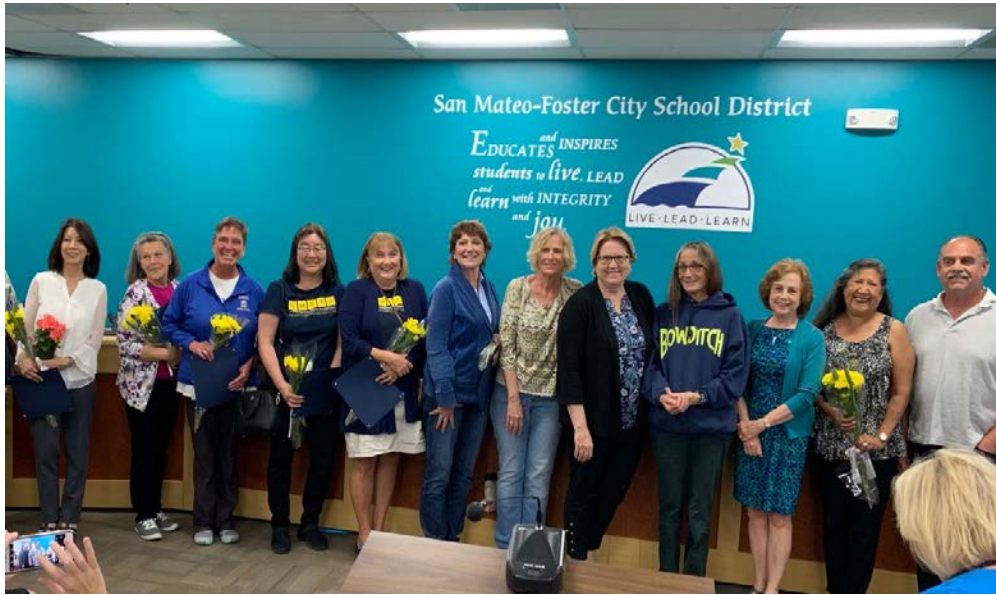
2019 SMFCSD Retirees

Congratulations to our SMFCSD retirees! Thank you for your many years of service to our children and our community. We wish you all the best!