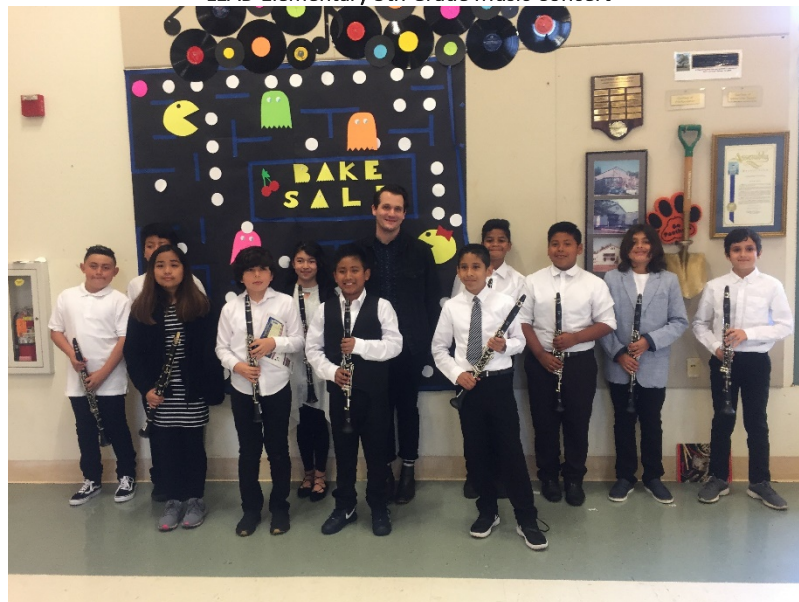
San Mateo Park Musicians

"Our 5 th grade music program gives students the opportunity to make music come alive. Three of our students played their instrument in the Talent Show because they were so proud to share what they had learned. Then, at the music performance, all of our students continued playing their instruments well after it was over. It has become a passion for our students which has opened up so many doors."