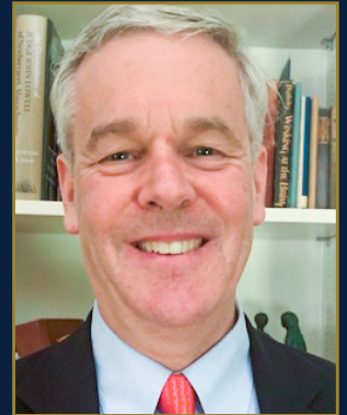
Class of 2021