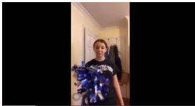
Bomber Cheer Spirit