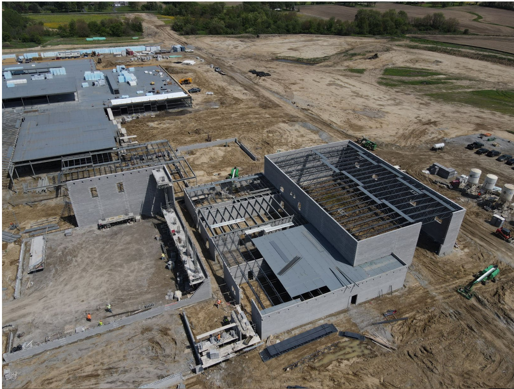
Gymnasiums and Locker Area