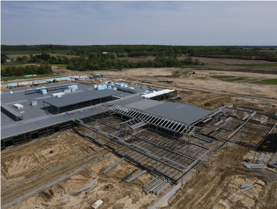
Administration and Cafeteria