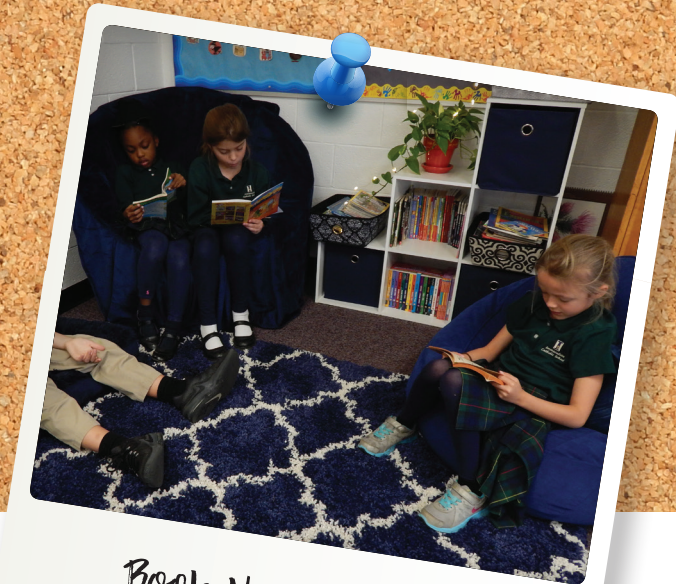
Book Nook in 3B

The Fall Fundraiser "Raise the Paddle" brought in an impressive $6,150 for the arts, $6,050 for athletics, and $7,100 for STEM and technology.