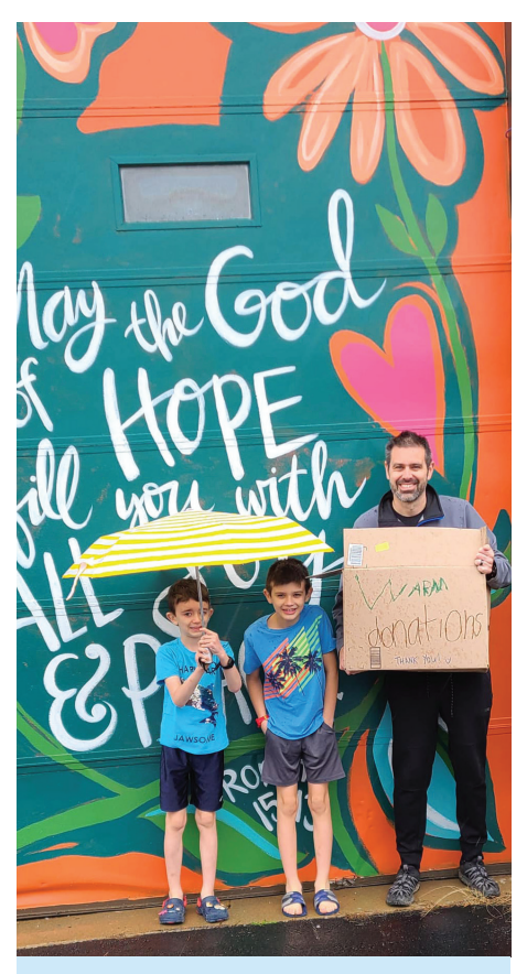
Service plunge volunteers in action on March 19.

Eleven service organizations were supported through the service plunge, including Boardman Arts Park, Family Promise, Habitat for Humanity's ReStore, Lutheran Social Services, People In Need of Delaware County, Powell Liberty Historical Society, Preservation Parks of Delaware County, SourcePoint, Turning Point, Westerville Area Resource Ministry (WARM) and the Women's City Club of Delaware.