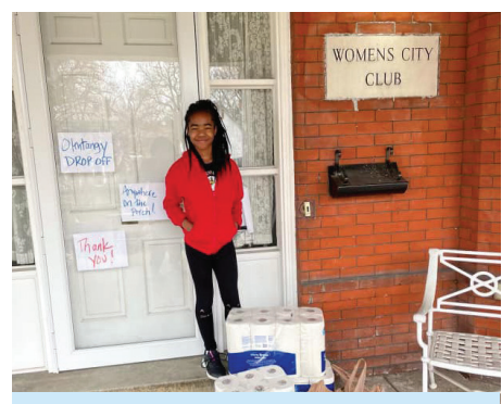
Olentangy student delivers donations to Women's City Club.