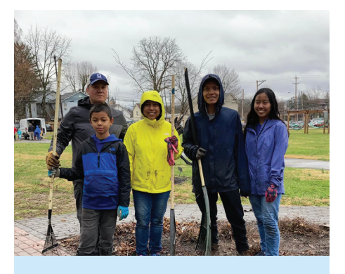
Olentangy families clean Boardman Arts Park.