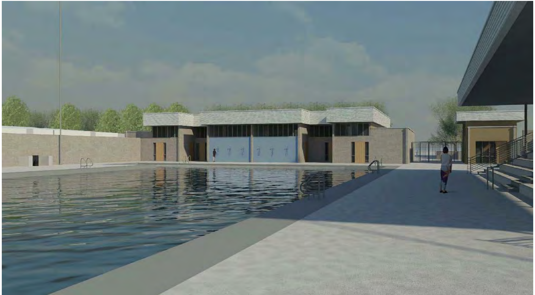
View of new pool facility looking toward Locker Building and Ticket/Concession Building