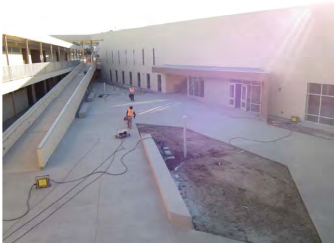
Building A Courtyard