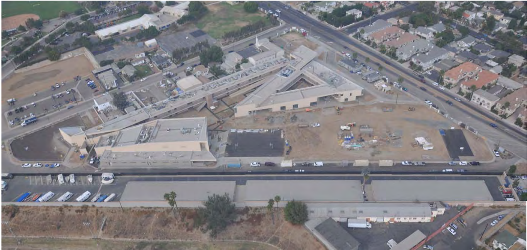
Aerial view of site