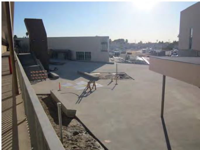
Courtyard between Bldg. C and D