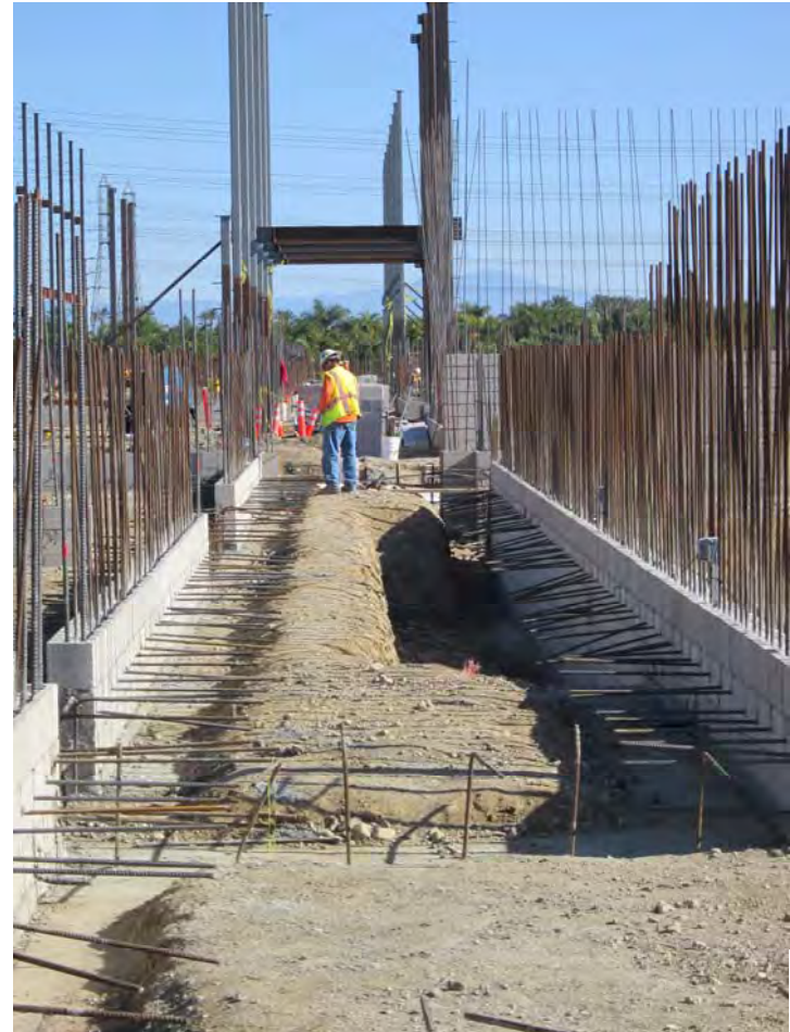
Bldg. F Corridor