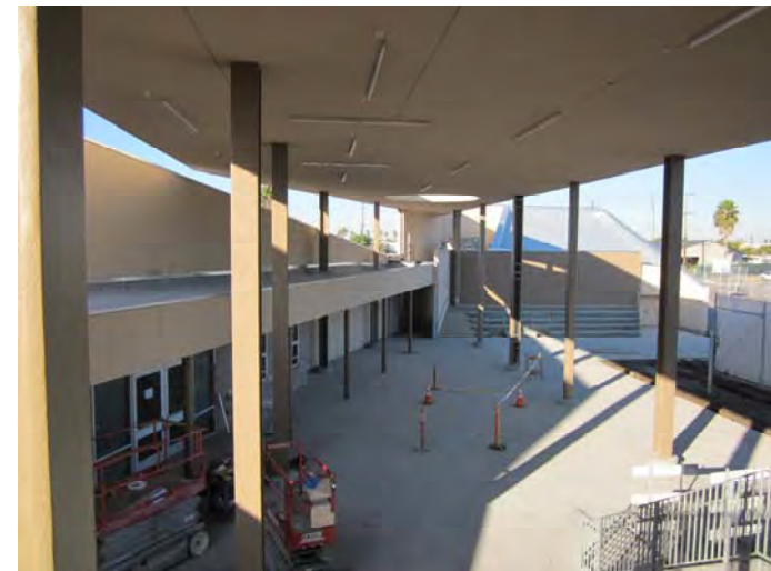
Courtyard between Bldg. D and E