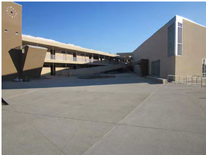
Courtyard between Bldg. A and B