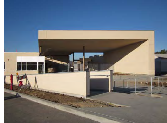
View of Main Entry / Bldg. A