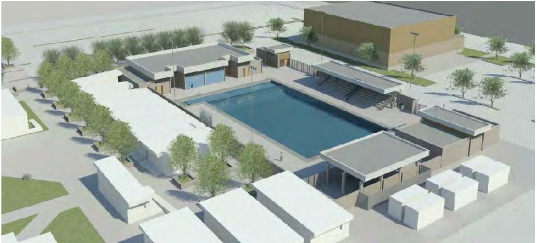
Birds-eye view from the northeast portion of the new pool facility