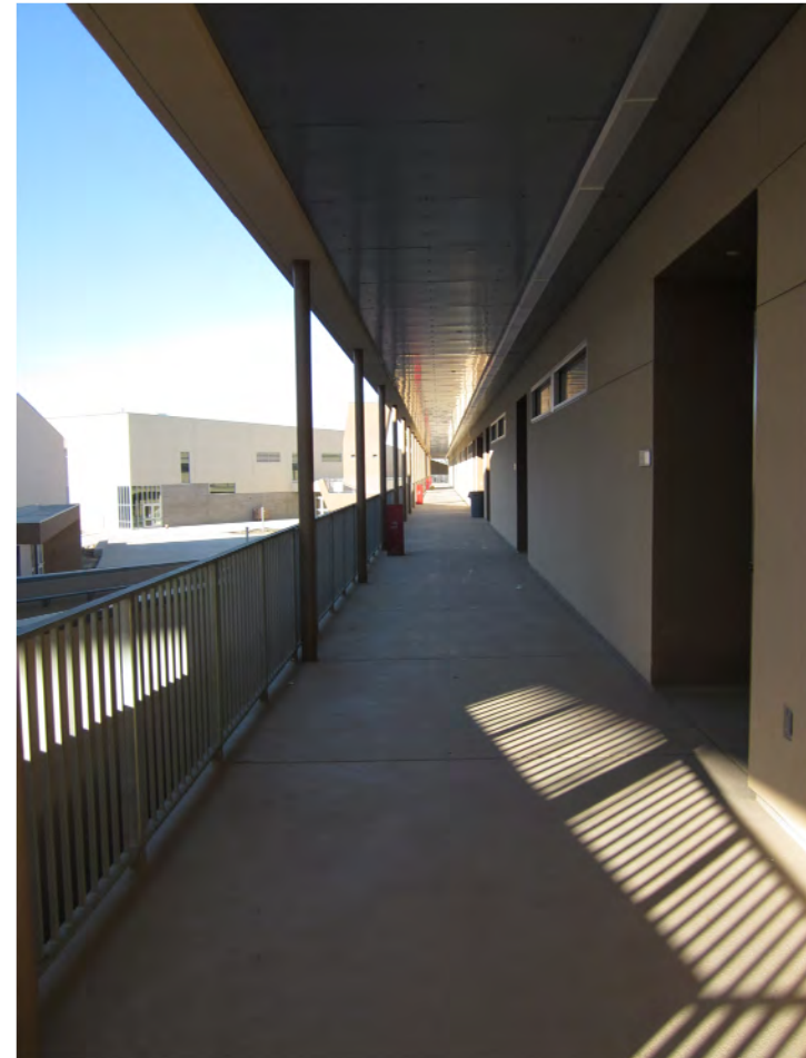
Bldg. C Corridor