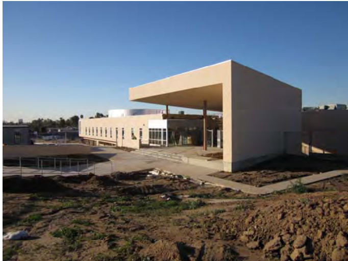
View of Main Entry / Bldg. A