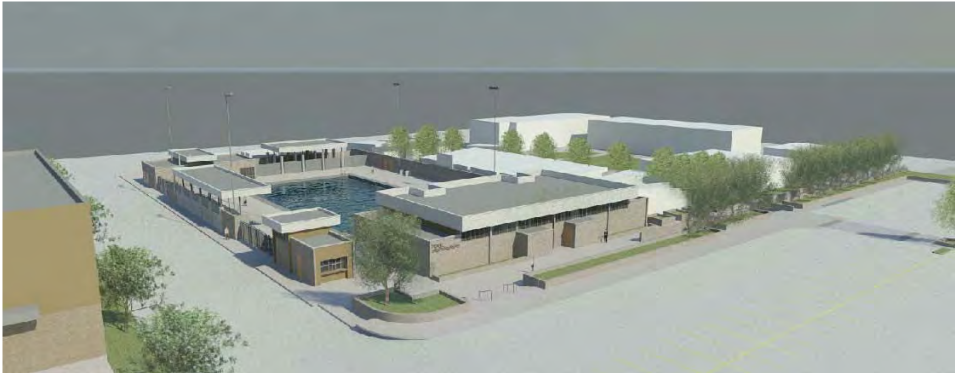
Birds-eye view from the southwest portion of the new pool facility