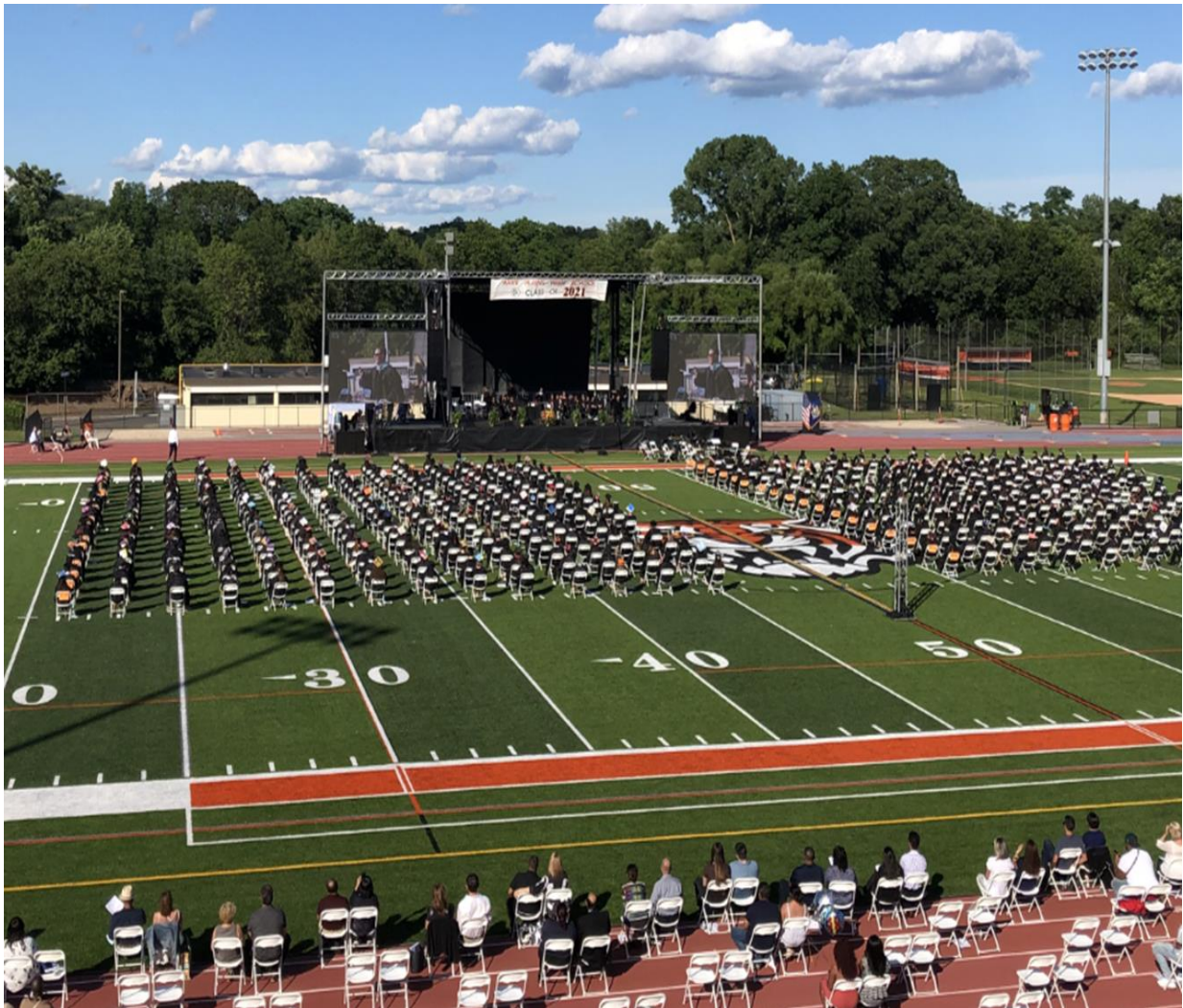
PHOTO OF JUNE 2021 GRADUATION CEREMONY (similar setup desired for this year)