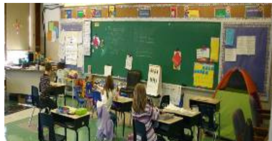
Students in a class at the Montgomery County Learning Center on Wilmington Pike.

Student community activities included several experiences in the field of fine arts as well as volunteer work activities at many sites. Students also participated in a talent show. These educational field trips help students to learn the proper behaviors in social settings. Highlights of the year included the annual MD prom, the MD graduation and the ED eighth grade graduation.