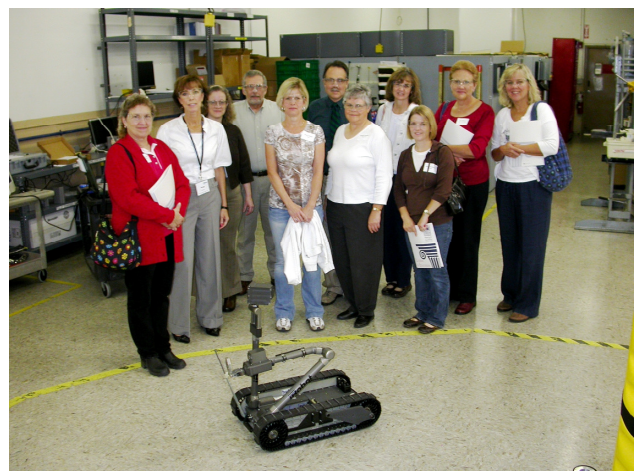
STEM Fellows using the STEM kits and curriculum they developed.