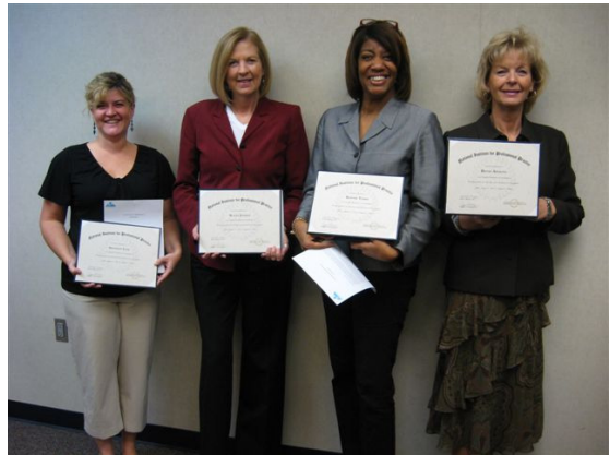
Curriculum staff completed Marzano training.

(see our website at: www.mcesc.org for more information and teacher tools)