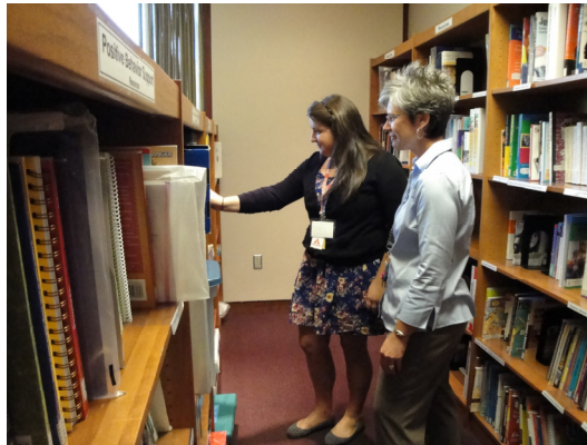
Two area teachers reviewing library materials.