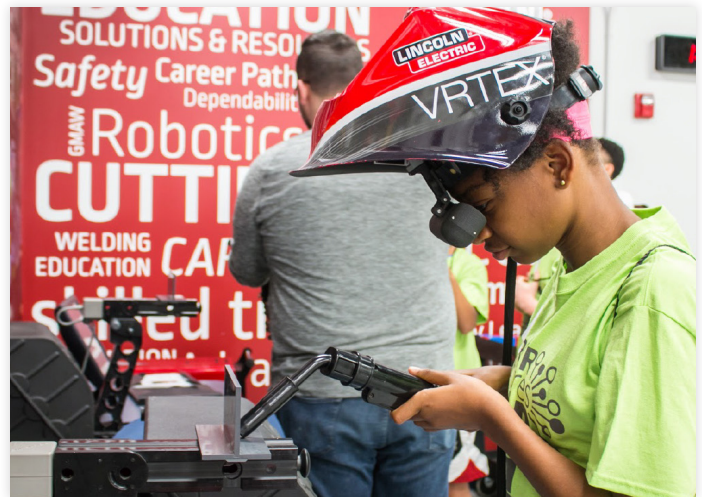
A Career Adventures Camper learns a new skill.

2. We've adapted quickly! Let's celebrate the success of Construction Appreciation Week and Manufacturing Month! We'd like to take a moment and thank our partners that helped us put together these wonderful videos, resources, and events!