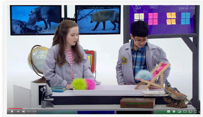
I Can Be Anything I Want to Be A to Z: Nurse Practitioner Click on the image above to view the video.

We recently held a Graduation Network Meeting to assist districts in properly navigating this year's challenges and supporting students through graduation. We're also exploring ways we can train some of our teachers to better reflect the industries they are training students to enter. One such effort occurred this summer via a collaboration between SOCHE and CareSource with an IT Teacher Externship pilot. Since this effort, we've also worked with Counselors for Computing to enroll teachers in training around computer science career exploration. In addition, our Career Champions and Counselors Network continues to work closely with industry leaders to learn about the different in-demand career fields in our region.