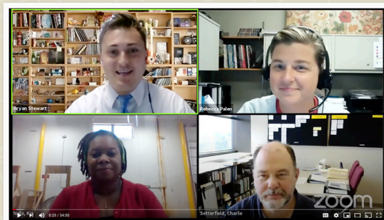
MCESC Construction Appreciation Week Day 4: Sinclair's Construction Boom Click on the image above to view the video.