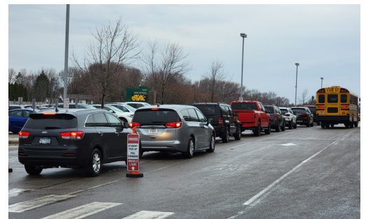
PICTURED: Traffic congestion at Park High School includes cars blocking bus lanes and pedestrian crossings.

Learn more at sowashco.org/facilityplanning or email info@sowashco.org