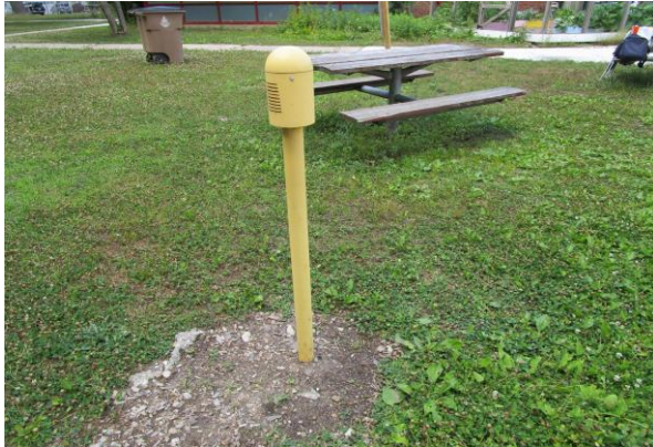
Freestanding Equipment Talk Tubes (2) Miracle Recreation