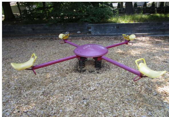
4 Seat Buck-a-Bout GameTime