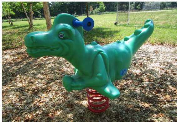
Dinosaur Spring Rocker