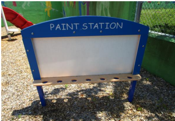
Paint Station Play & Park Structures