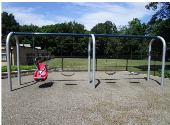
8ft. Swing Set (2Bay/3Belt/1Inclus.) Landscape Structures