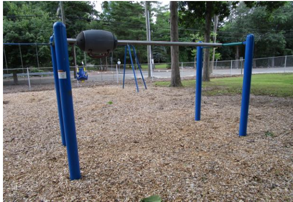
Space Shuttle GameTime