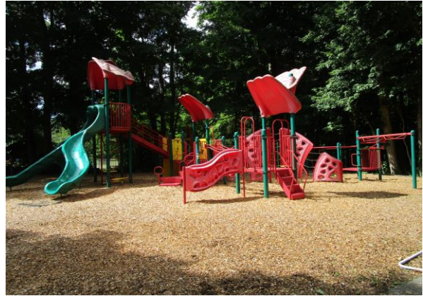
Play & Park Structures