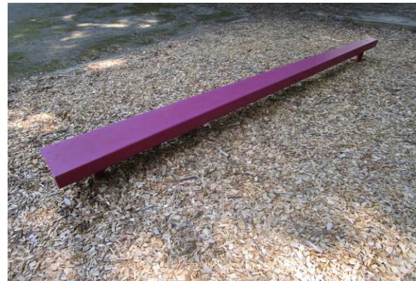
Balance Beam GameTime