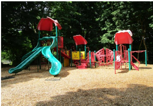
Large Composite Structure