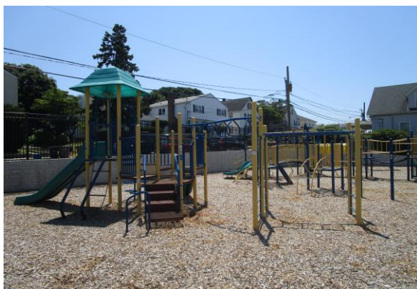
Large Composite Structure #2