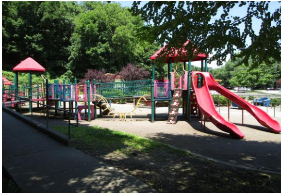
Freestanding Equipment Music Panels (2)