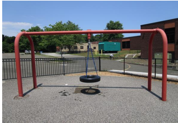
7ft. Tire Swing Landscape Structures