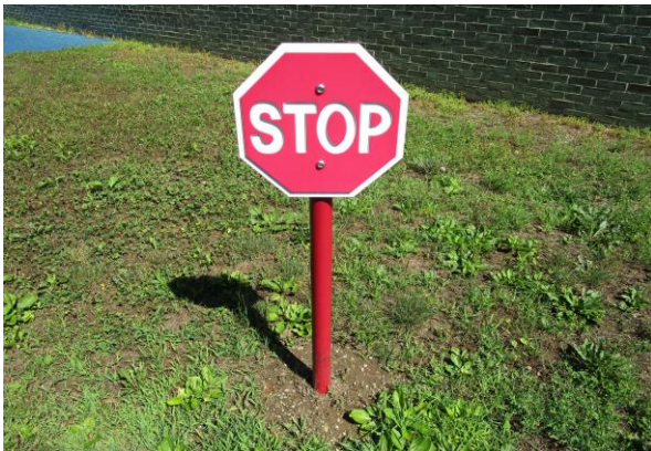
Stop Sign BCI Burke