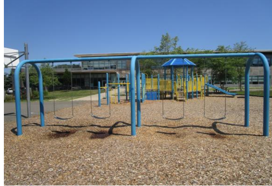
Sports Play Equipment Inc.