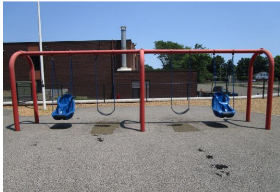
Freestanding Equipment 8ft. Swing Set (2 Bays/2 Belt/2 HDCP) Landscape Structures