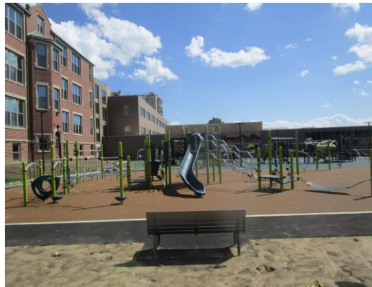
Medium Metal Composite Structure #2