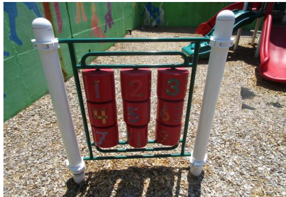
Play & Park Structures