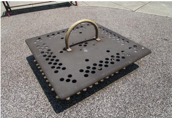
Rock-It-Cube Landscape Structures