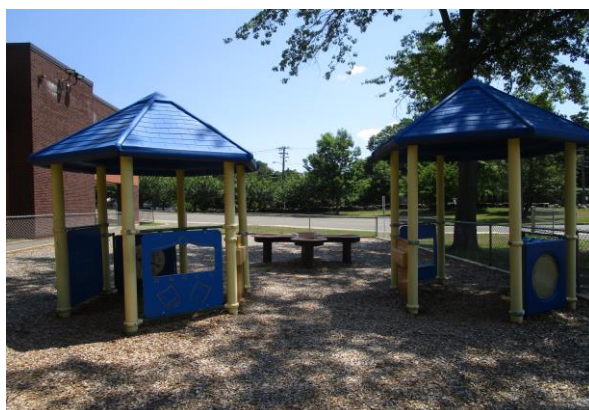
Sand Water Table