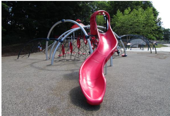
Freestanding Equipment Slidewinder Embankment Slide