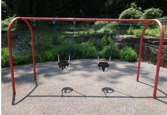
7ft. Swing Set #1 (1Bay/2Encld.Tot) Landscape Structures