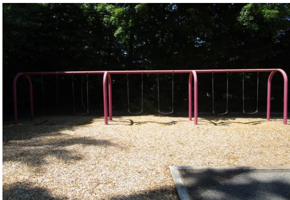
8ft. Swing Set (3 Bay/6 Belts) GameTime