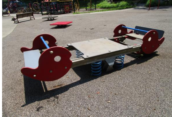
Multi-Spring See-Saw Kompan