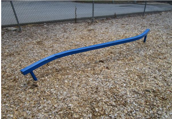
Freestanding Equipment Curved Balance Beam GameTime