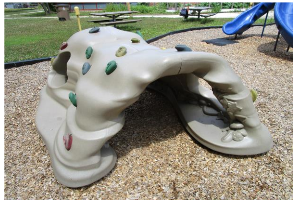
Crawl Thru Rock Climber Play & Park Structures