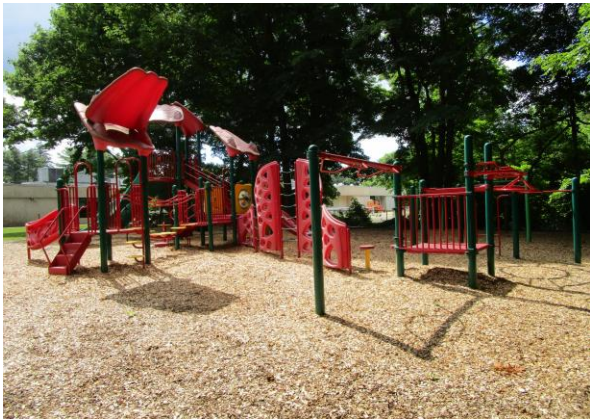
Large Composite Structure