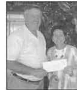
Stella Downs Park City Elementary