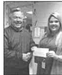
Whitleigh Harp Red Cross Elementary