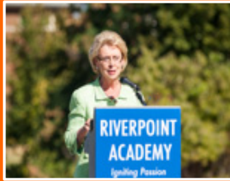
Washington Governor Christine Gregoire