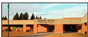
Shiloh Hills Elementary – Est. 1980 34 years old

Recommendations from the Facilities Planning Committee are summarized below and include ten major categories/project types. Projects range from security upgrades, as recommended by the Safety Taskforce, to major projects that include the modernization of Shiloh Hills and Midway elementary schools and replacement of Northwood Middle School – all three schools qualify for state match monies.