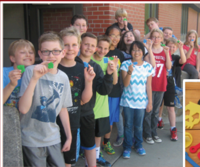
Farwell Elementary 5 th Graders