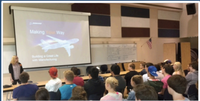
Boeing Recruiters Address Mead & Mt. Spokane Engineering Students