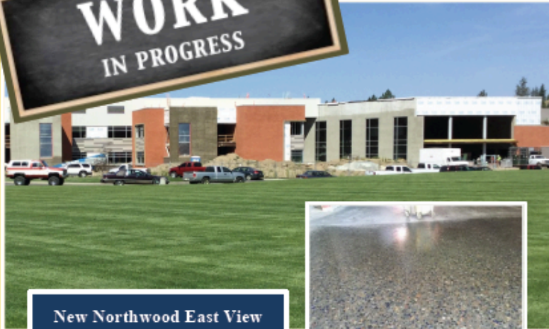
New Northwood East View Polished Concrete Floor