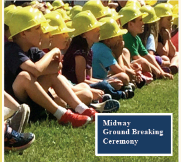
Midway Ground Breaking Ceremony