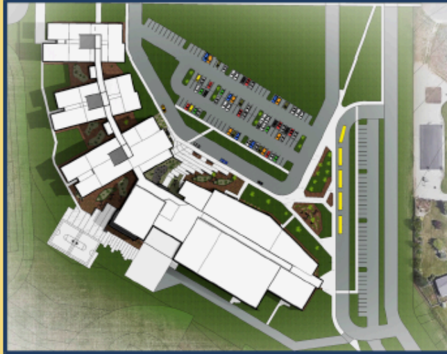
Five Mile Prairie Middle School