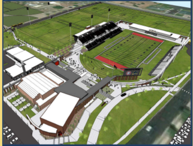
Performing Arts-Athletic Venue/Stadium