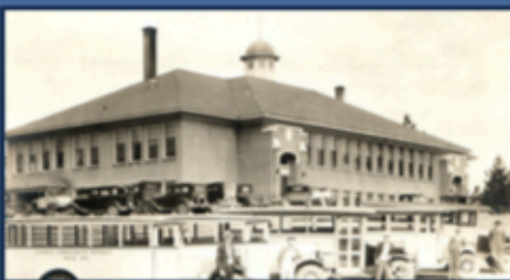
12509 N. Market, Mead, WA