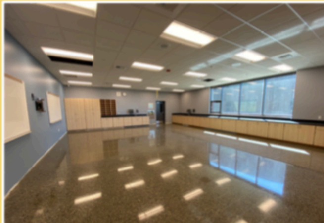
Highland Middle School Science Classroom