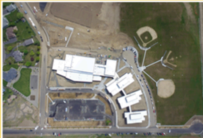
Aerial View Highland Middle School