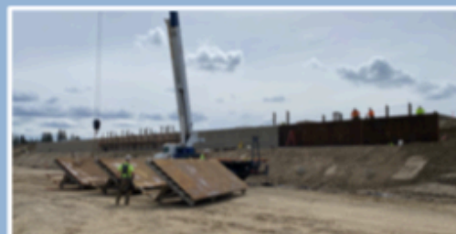
Home Bleachers Retaining Wall