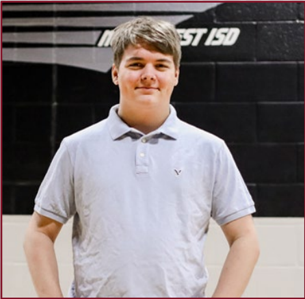
Caleb Aultman Steele Early College High School