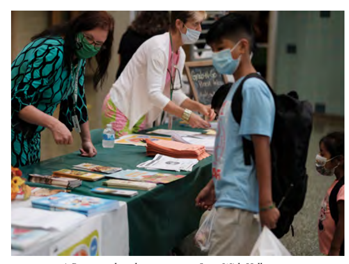
A Brentwood student at a recent Start With Hello event.