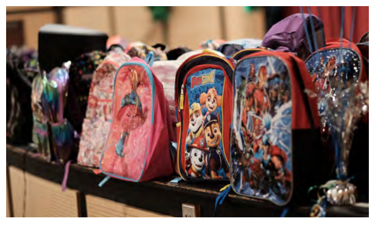
Collected backpacks, donated by the community!