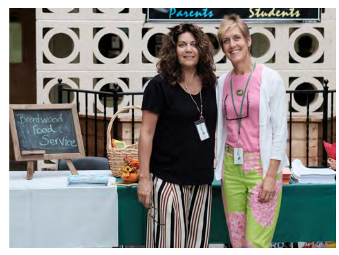
The Brentwood Food Service Department distributed delicious meals and health and nutrition information.

Special Thanks to True North Ministries, We Couldn't Have Done it Without You!