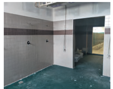
Ross High School Showers