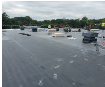
Freshman Center Roof

Taken together, these construction and technology infrastructure projects will leave Brentwood schools poised to meet the needs of the 21st-century child better than at any point prior and bring a renewed sense of pride in the Brentwood Schools Community.