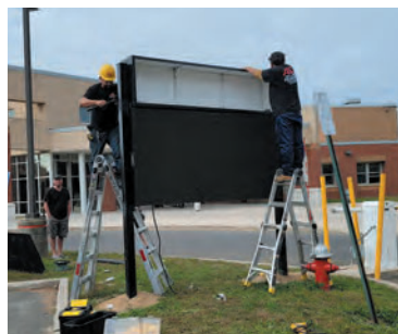
Ross High School LED Sign