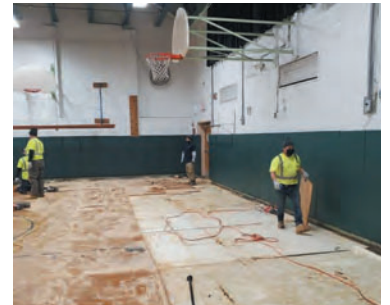
Northeast Elementary School Gym