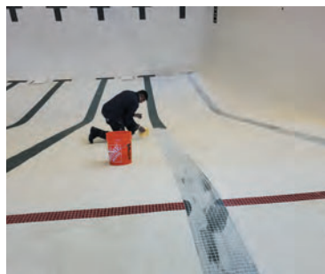
Ross High School Pool