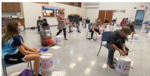
7th grade students play an eight-measure rhythm independently as they wrap up their Bucket Drumming unit.

Students can explore music through Band, Choir, Voice, Music Appreciation , and General Music courses. 6th graders can choose to sign up for Guitar. In 7th grade music, students learn many different concepts including an exploration of rhythm. In 8th grade Music Appreciation, students listen to different types of music including the blues and early rock & roll.