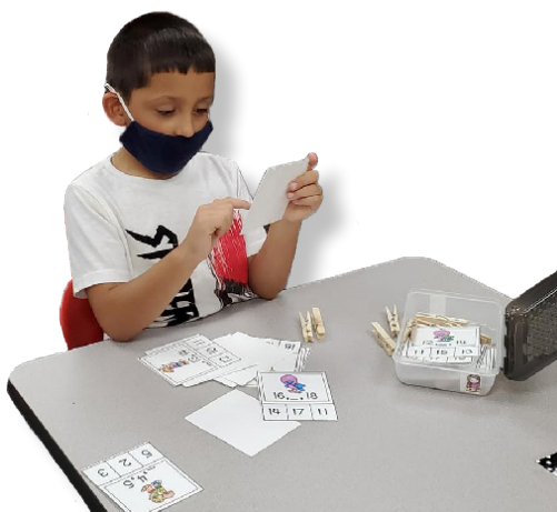
A student counts syllables in the word that is associated with the picture as part of Literacy Collaborative.

Literacy Collaborative has changed the face of literacy instruction for all students at the ECC. It has helped us see the potential in even the youngest students in our community to be thoughtful readers and writers, to be curious about their learning and, most importantly, to find and experience a love of literacy.