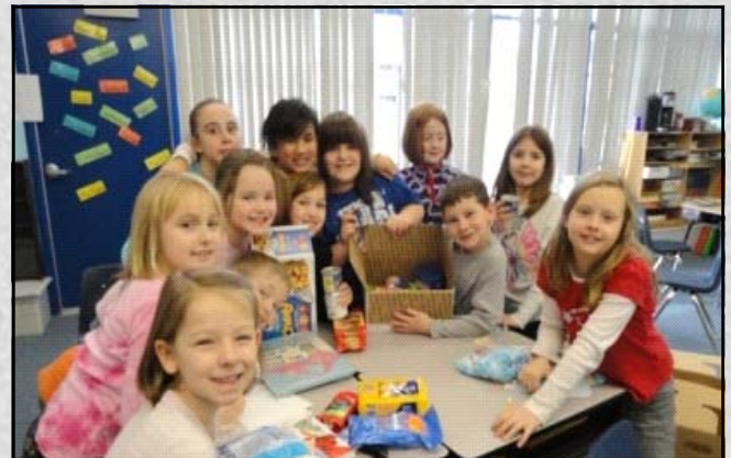
Poage Elementary Students showing support for our troops!