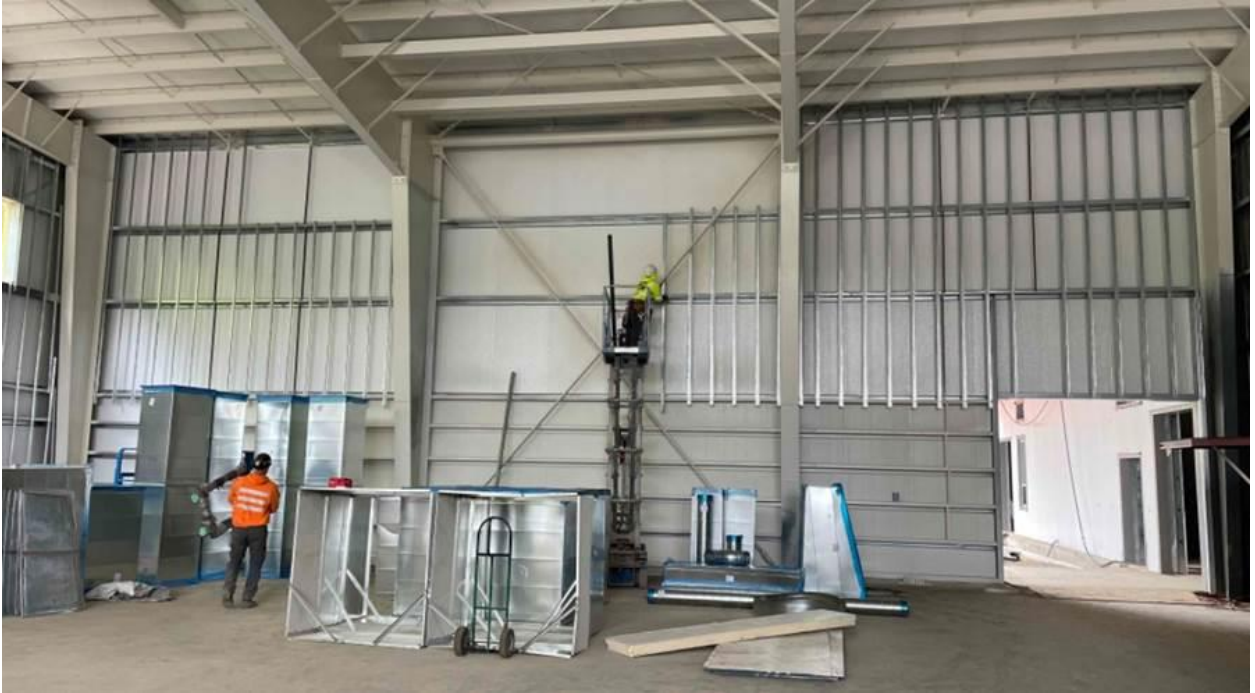
Framing work in the Auxiliary Gym