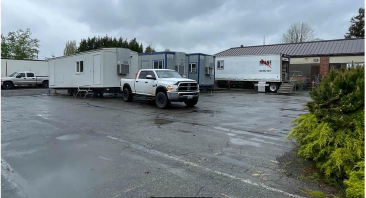
Construction trailers being relocated to new parking area between Old Main and CTE Wing