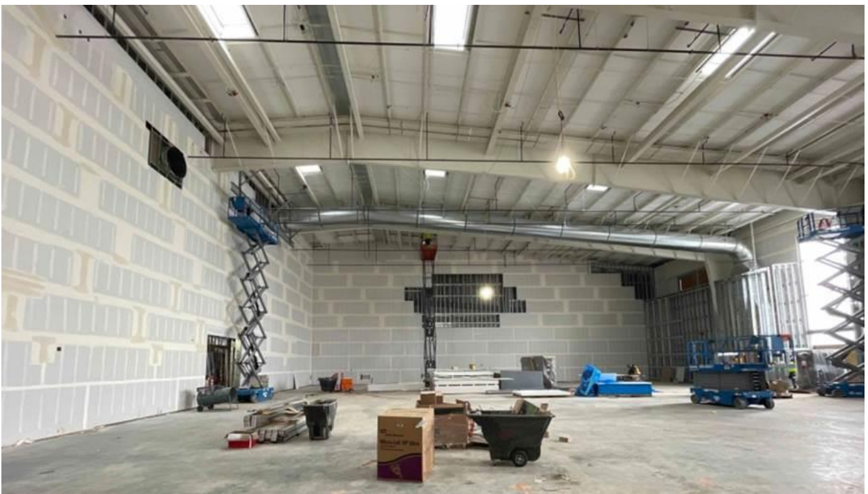
Sheetrock installation in the Main Gym