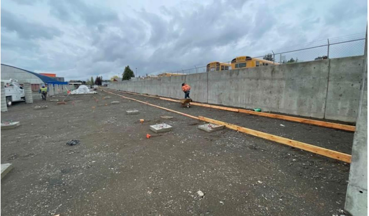
Crews installing formwork for the hardscapes around the Grandstands