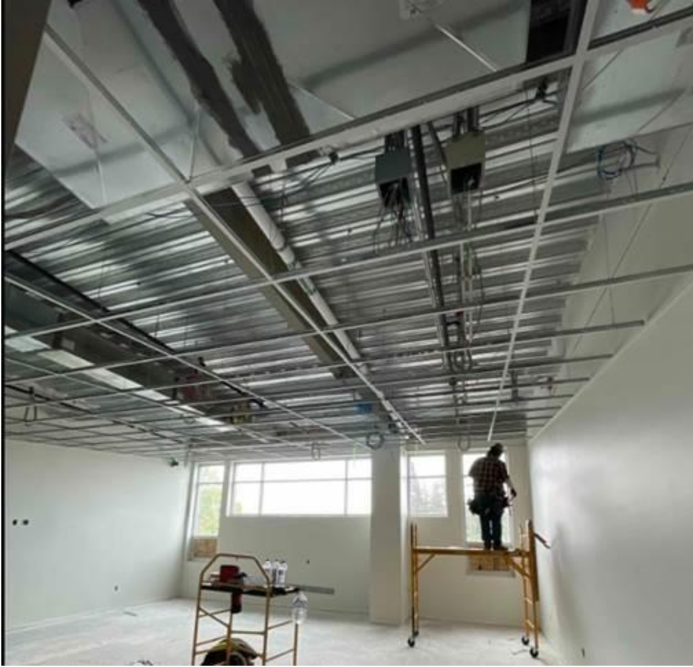
Crews installing the ceiling grid in the Academic Wing