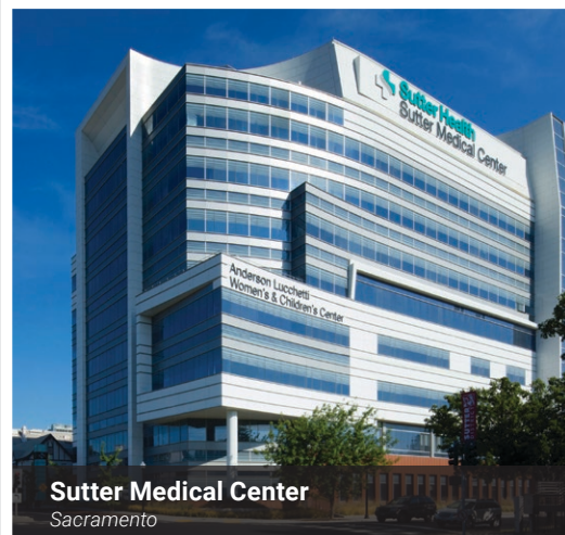
Sutter Medical Center Sacramento