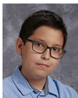
Santino Moscoso Rondon Art