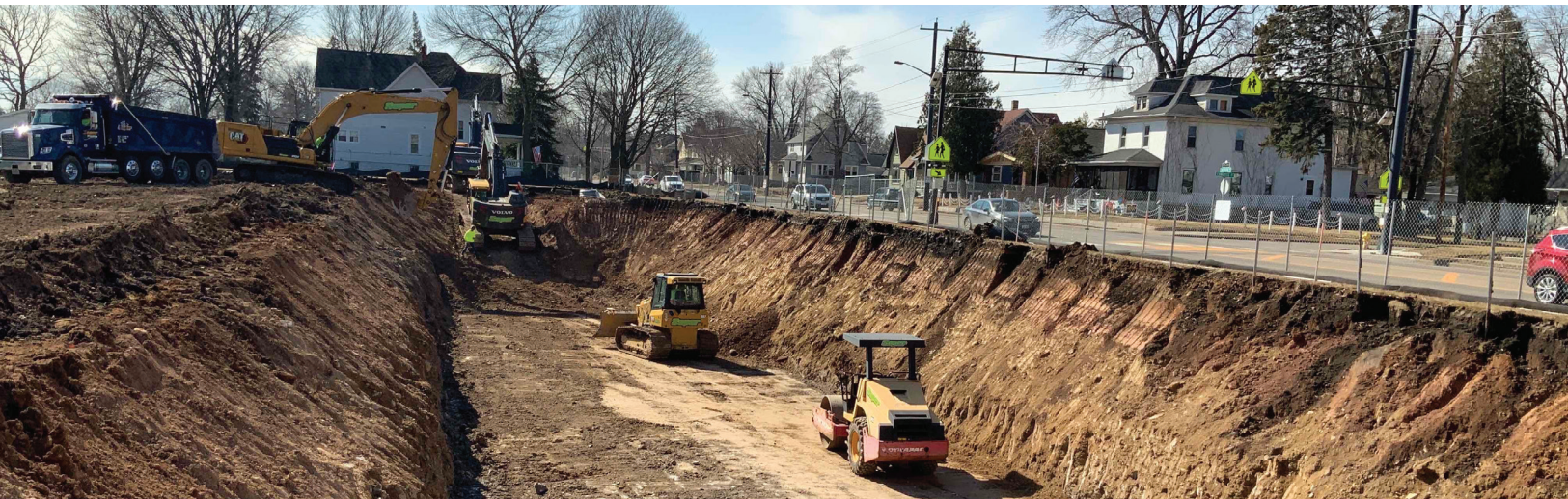
EXCAVATION FOR THE WATER RETAINAGE SYSTEM AT VEL PHILLIPS MIDDLE SCHOOL