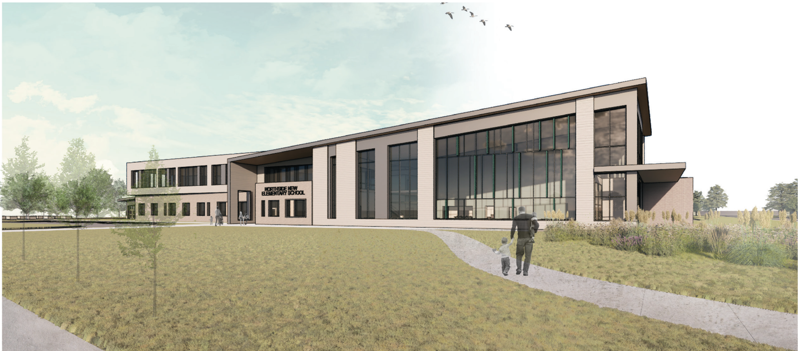
CONCEPTUAL RENDERING OF THE NEW NORTHSIDE ELEMENTARY SCHOOL