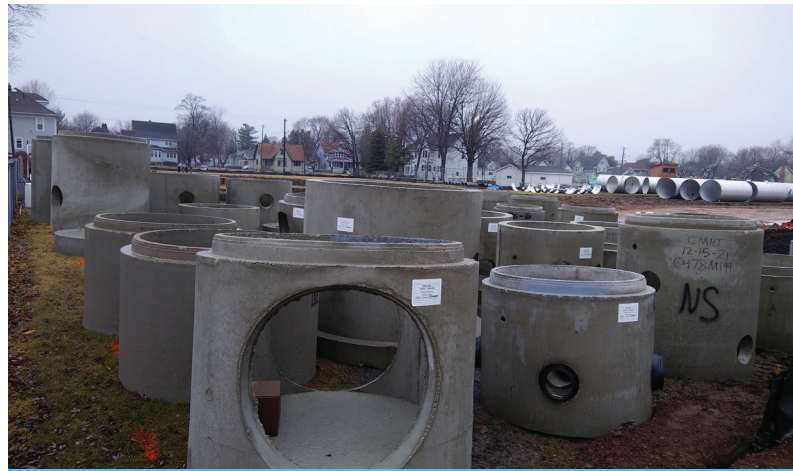
CEMENT DRAINAGE CATCH BASINS AT VEL PHILLIPS MIDDLE SCHOOL