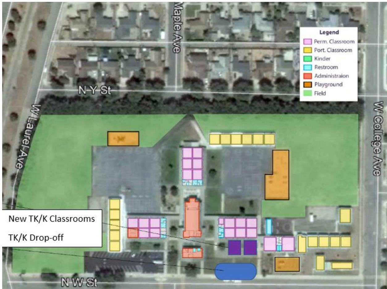
Figure 4 – Clarence Ruth Elementary School Proposed TK/K Facilities

and K students. The current playground will be used and shared with the kindergarten students. The goal will be to create and expand a TK/K village within the school that promotes propinquity, teacher interaction, parent access and shared support spaces for the benefit of TK/K students. The addition of the two permanent TK classrooms to the site will also assist in meeting the District’s adopted educational specification for elementary schools at the site as well as provide the necessary space to accommodate the anticipated increase in TK enrollment.