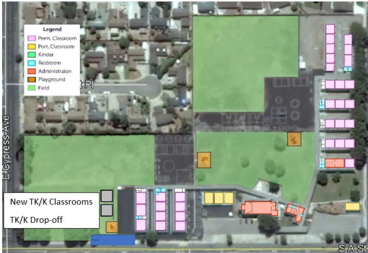
Figure 5 – Arthur Hapgood Elementary School Proposed TK/K Facilities

The addition of the TK classrooms at this site may also have the added benefit of strengthening the Dual Language Immersion program and better prepare students to be fully bilingual in English and Spanish if the program is expanded to include the TK students.