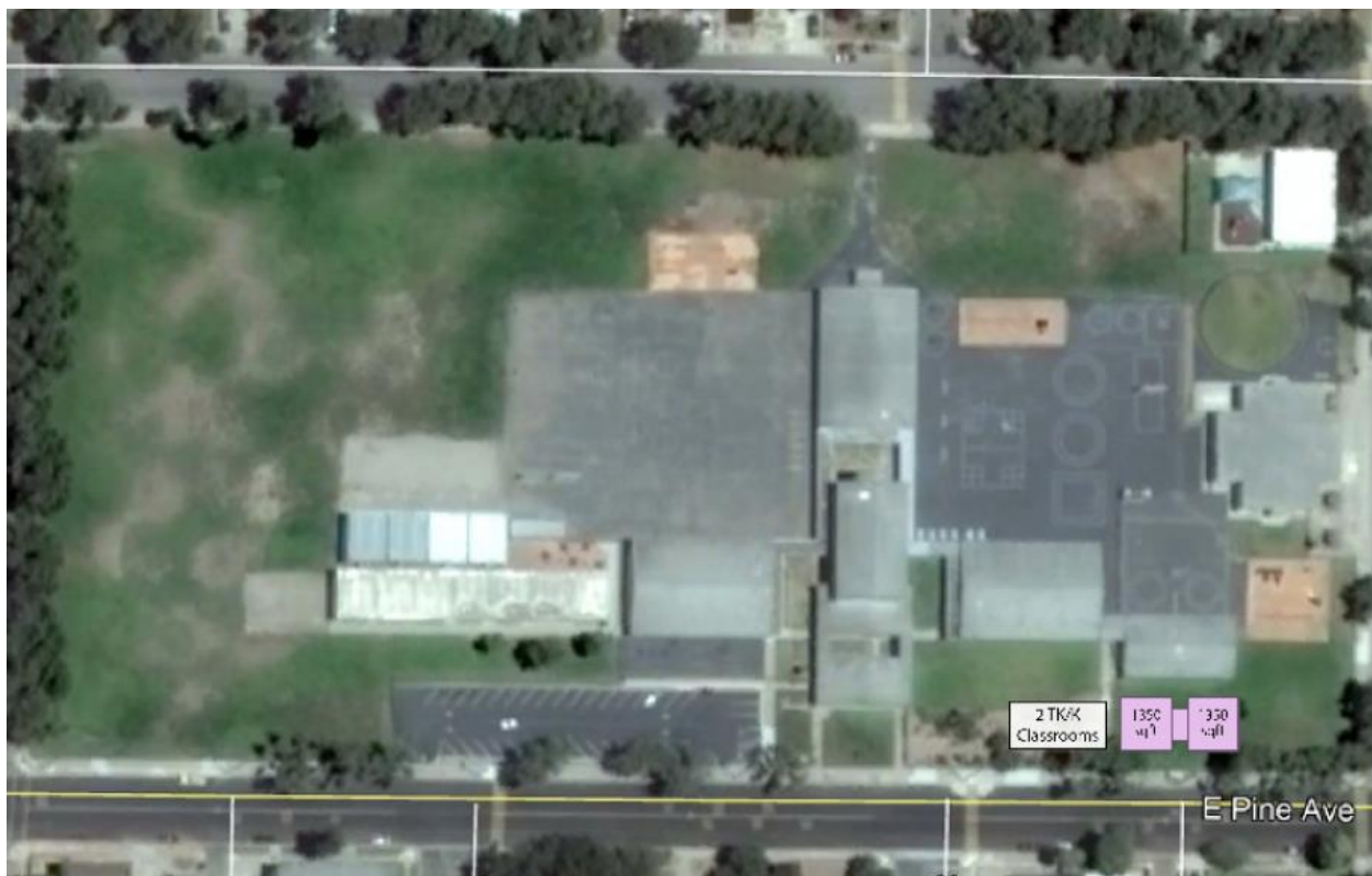
Figure 2 – Fillmore Elementary School Proposed TK/K Facilities

It is contemplated that the proposed classrooms be located at the southeast corner of the school buildings near East Pine Street, parallel to the existing kindergarten classrooms. The existing kindergarten playground to the east would be accessible for kindergarten students in the new classrooms. Potential site improvements could be made for pick-up and drop-off along Sixth Street to accommodate lesser traffic and a more welcoming access point. Overall, the goal would be to add to the creation of a TK/K village within the school that promotes propinquity, teacher interaction, parent access and shared support spaces for the benefit of TK/K students.