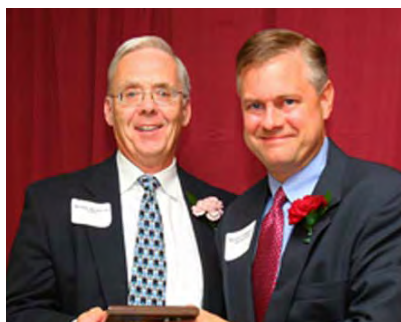
Savage retires from BOT | 23