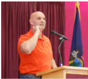
Patterson Lecture Series: Integrity | 8