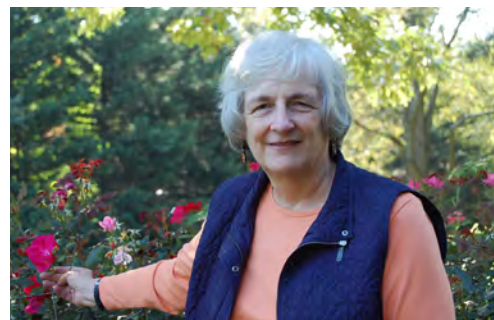
MCI Alumni Awards | 19