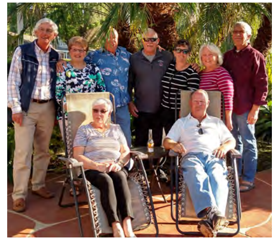
Class of 1968 gathering in Florida

The countdown is on for the 50th MCI Reunion for the Class of 1968. Plans for several gatherings will be finalized in May and the last letter before Reunion will be on its way with all the details. (If you are not receiving the letters, please let me know or notify MCI as soon as possible.) There has been lots of chatter about our 50th and many classmates are planning to attend. Along with the MCI Activities on campus, various parties and gatherings will be held throughout the weekend. There will be lots of opportunities to see old friends and classmates and catch up. Come to any, come to all, but PLEASE COME! It will be a great time!