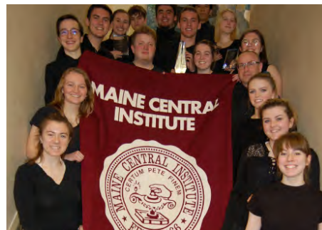
Arts Update | 9