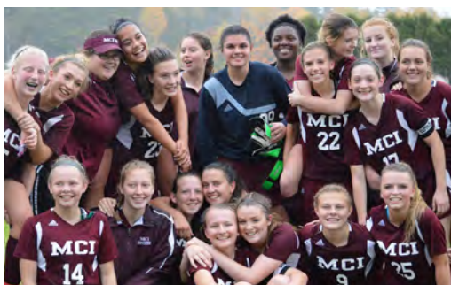
Athletics Update | 12