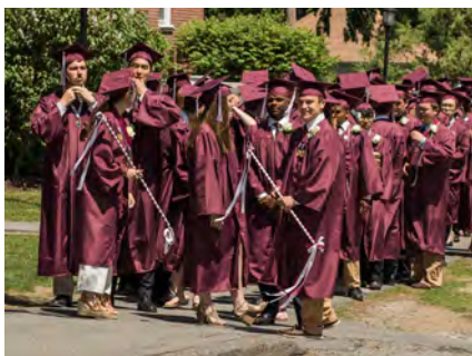
2018 Commencement | 16