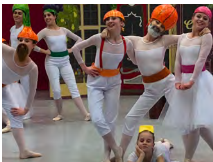
Bossov Ballet Theatre | 11