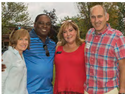
Reunion | 20