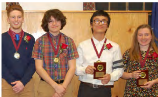
Academic Achievements | 6