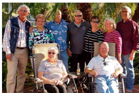
Class Notes | 28