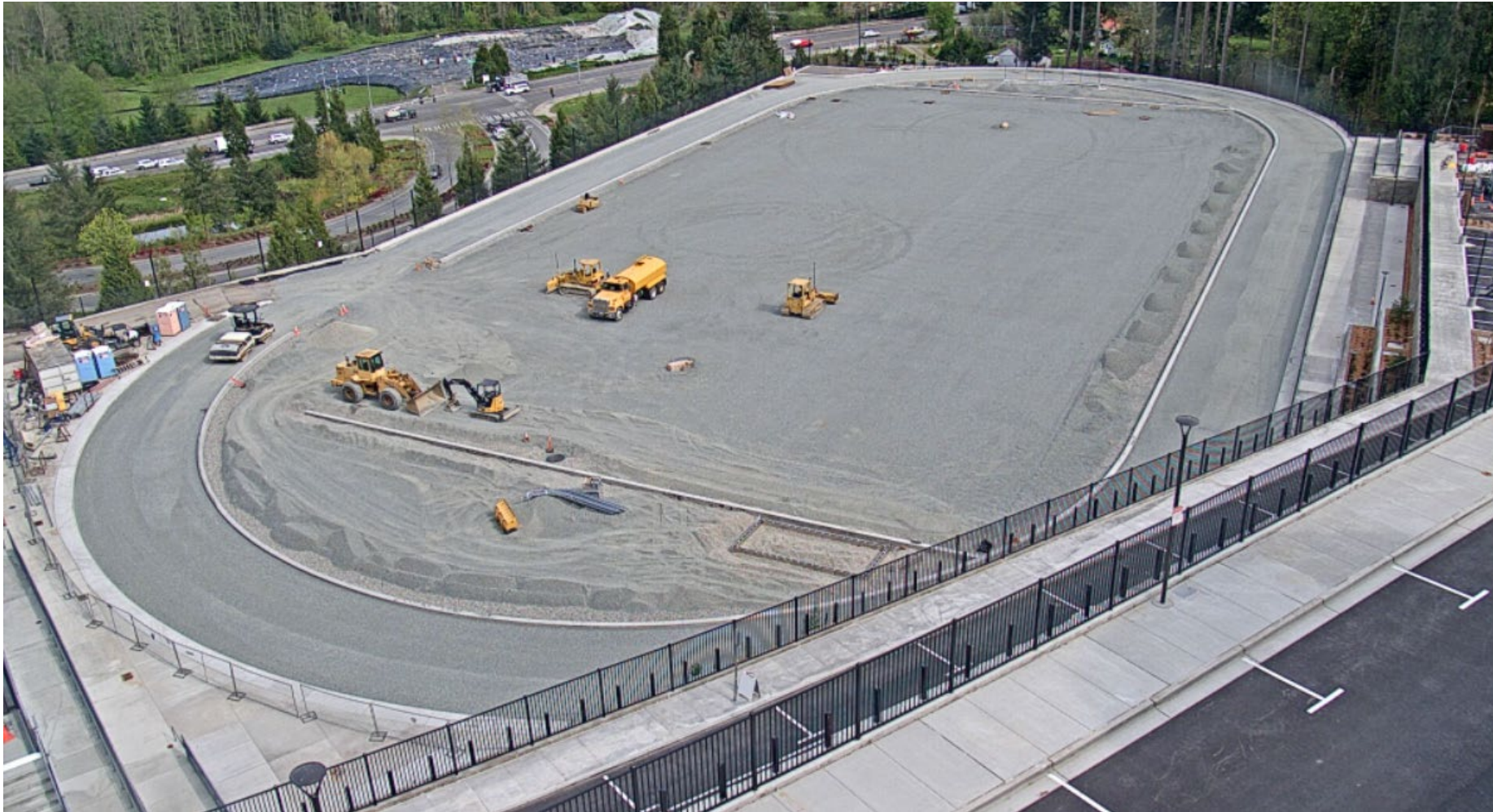
Sports Field work progressing.