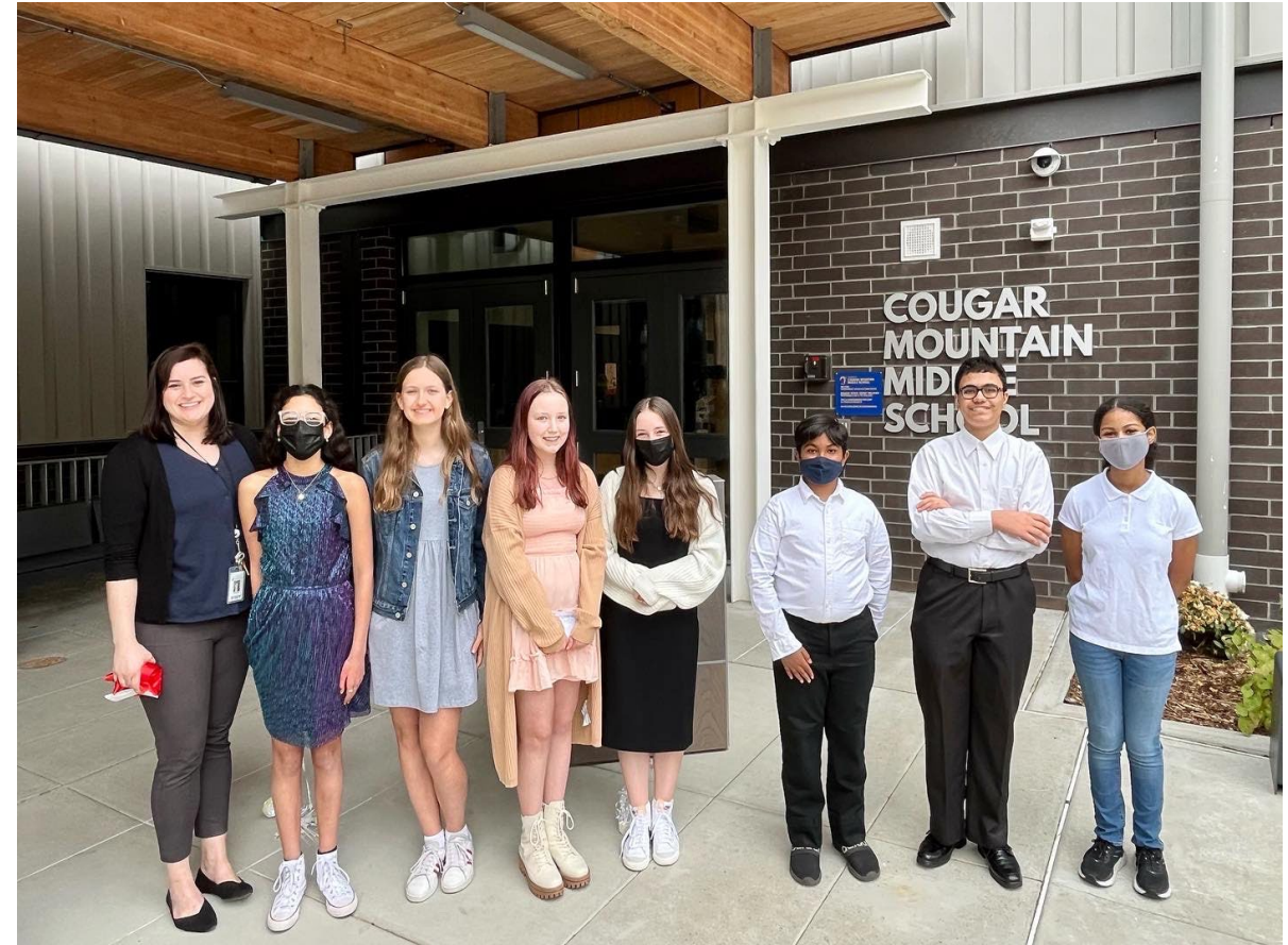
The Ribbon Cutting/Building Dedication Ceremony Held April 25th